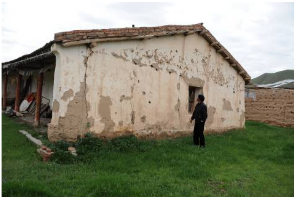
Ra Ji, Amne area, the source region of the Yellow River, China

Zha Xi – “In the past, there were more than 20 streams formed by the meltwater of the Gladin Glacier. Those streams were flowing down like the space between my fingers. Now there are only seven or eight streams left.”