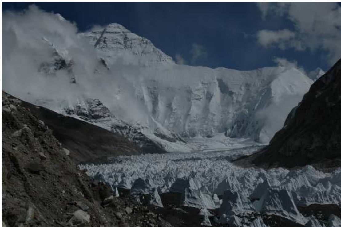
Glacier at Mt. Everest

Asia's 'water tower' refers to the Himalayas and the Qinghai-Tibet Plateau region. The Himalaya-Qinghai-Tibet Plateau glaciers feed the headwaters of Asia's seven major freshwater rivers. These rivers include China's Yellow and Yangtze rivers, as well as India's Ganges, Brahmaputra, Mekong, Salween, and Indus. Climate change is causing the glaciers that feed these rivers to melt at an unprecedented rate.