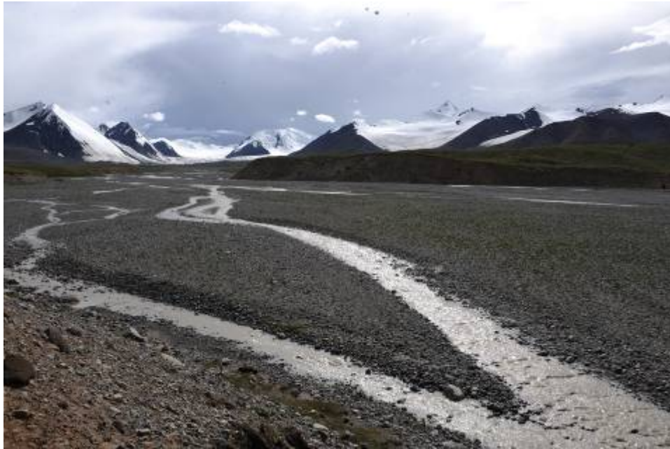
July 2009, Tuotuo River, Yellow River Source, China