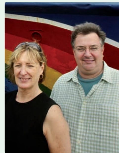
Main image: Greenpeace vessel 'MY Esperanza' crosses the Western Pacific through Palau's territorial waters.

Front cover image: Greenpeace activists unfurled a banner from the famous Christ statue in Rio de Janeiro to call on governments to protect global biodiversity.