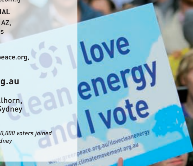
Image: Huge crowds of around 50,000 voters joined the Walk Against Warming in Sydney