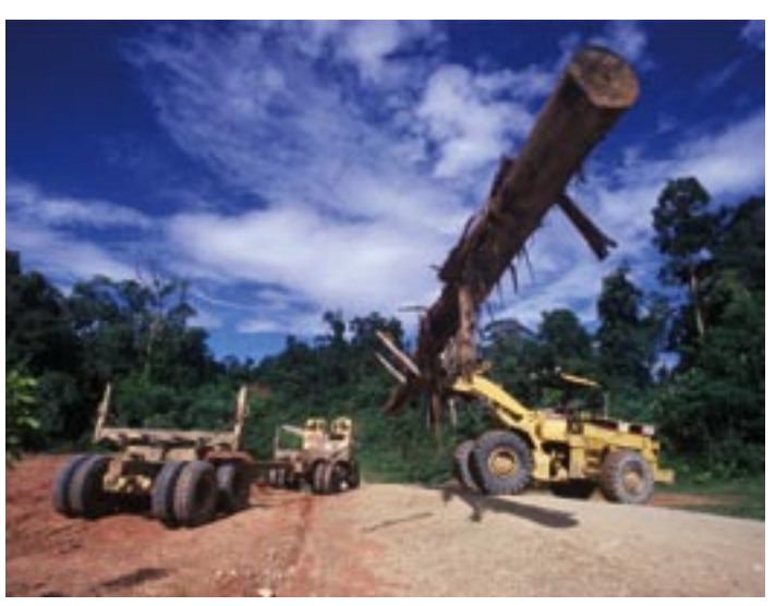
In Indonesia it is estimated that up to 90% of logging is illegal.

It should also be noted that much destructive logging is actually legal and that legal and illegal logging are often closely linked. Therefore addressing only illegally source timber is not sufficient to protect the world's ancient forests.