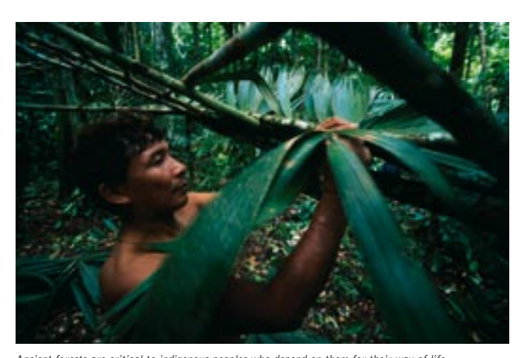
Ancient forests are critical to indigenous peoples who depend on them for their way of life