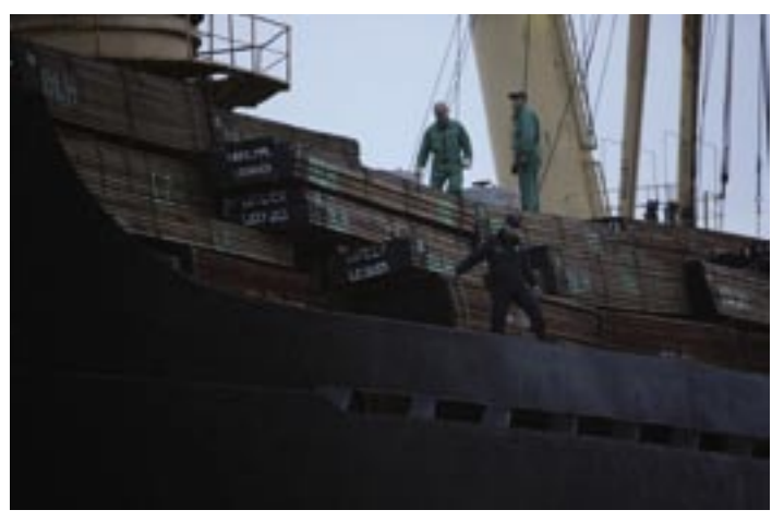
There is currently no law to stop the import of illegally logged timber into Europe