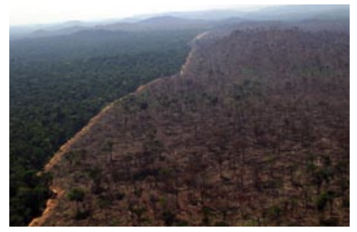
In just one year the Amazon lost an area almost the size of Belgium to rainforest destruction.

Nabiel Markarim, Indonesian Minister of the Environment, September 2002.