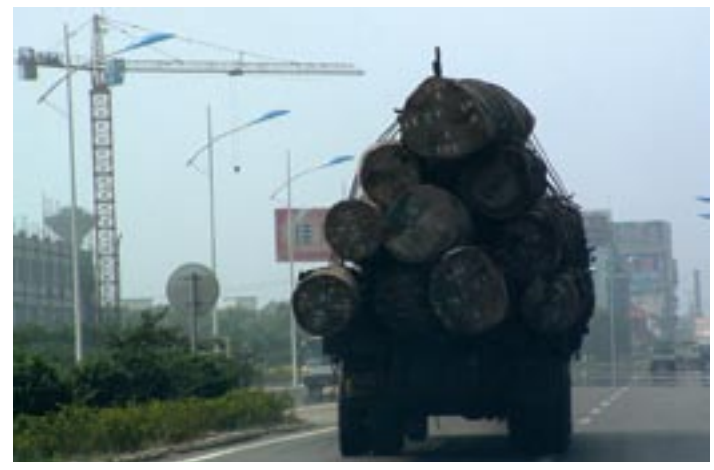
A truck loaded with African logs heads for processing into plywood in China.

EU Parliamentary Industry and Trade Committee, January 2004.