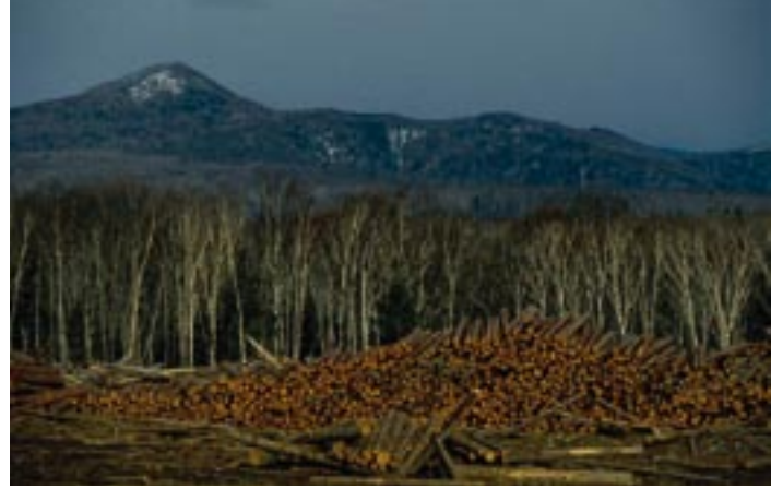
Logging in Russia is destroying ancient boreal forest

As a global political player and one of the largest importers of timber products, the European Union has a shared responsibility with timber producing countries to adopt measures to combat illegal logging and improve forest law enforcement and governance around the world.