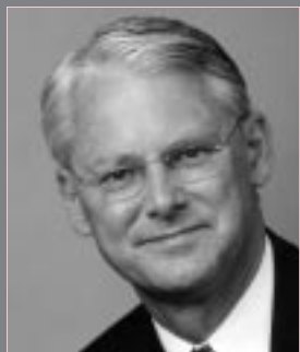
B.C. Premier Gordon Campbell