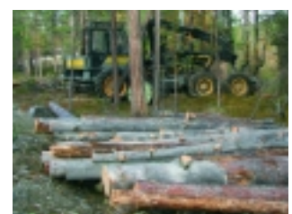
Logging of this old-growth forest area in Inari began in September 2003. Metsähallitus refused to negotiate with the local reindeer herders. Kantojärvi, Paatsjoki, Inari 2003.