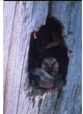
Hawk owl ( Surnia ulula ) nests in an old-growth tree. These large diameter snags provide important habitat for many of the cavity-nesting bird species found in Finland. Kajaani, Finland. 1998

It is clear that without a moratorium in place all these disputed areas are vulnerable to being logged.