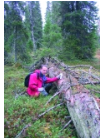
A recent field investigation in old-growth forests of Ruoskelkä-Pauttisselkä in September 2003 verified the presence of numerous red-listed fungi species. These species depend on the natural decay cycle for their survival. Decaying wood provides habitat for numerous vertebrates, fungi, invertebrates, lichens, plants and micro-organisms. This area is one of the approximately 50 sites where Metsähallitus has logging plans for year 2003. Ruoskelkä, Eastern Lapland, 2003

In June, Greenpeace and FANC presented a set of comprehensive maps that indicate areas of old-growth and high conservation value forest (474 in total) that should be subject to a moratorium, until the negotiation process has reached its conclusion. Metsähallitus then announced a halt in all new logging operations in the mapped areas.