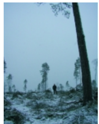
This used to be an important Inari Sami reindeer grazing area. In August 2003, Metsähallitus logged this area with a harvester. Metsähallitus did not negotiate the logging plans beforehand with the local reindeer herders, even though it is obliged to do so according to section 53 of the Reindeer Herding Act. Livikköjärvi, Nellim, Inari 2003