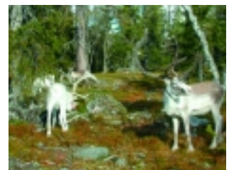
Arboreal lichen found in old-growth forests in Finland provides a critical food source for reindeer, especially in winter. Kemini-Sompio, Finland. 2002©Liimatainen/Greenpeace