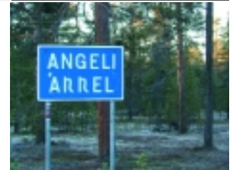
Sami reindeer herders of the Angeli village oppose Metsähallitus's new logging plans for areas located in the Paadarskaidi forest. They have filed a complaint to the United Nations Human Rights Commission in an attempt to prevent the logging in their reindeer grazing forests. Metsähallitus still intends to log these areas despite the Commission's request to its halt logging plans until the dispute has been resolved. 2003