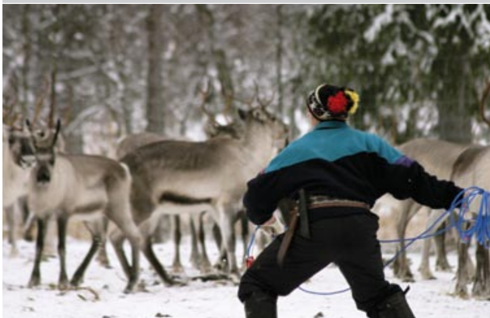
Reindeer herding is central to the Sami culture. Unless old-growth forests, critical to traditional reindeer herding are protected from logging, scenes such as these could become a thing of the past.

How the Finnish government is abusing the forest rights of Sámi reindeer herders