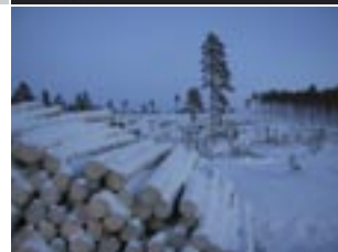
Despite repeated calls for a moratorium, logging still continues in areas important to reindeer herding. This area in the Paadarskaidi Muotkatunturi co-operative was logged December 2004.

In 2003 the reindeer herders together with Greenpeace and the Finnish Association for Nature Conservation (FANC) mapped out forest areas essential for winter grazing. Over 90% of the mapped forest areas were found to be old-growth forest.