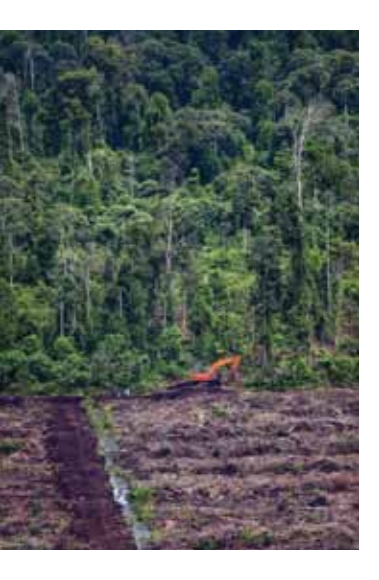
May 2013, Riau An excavator at the rainforest's edge in recently cleared peatland within the Duta Palma group's PT. Bertuah Aneka Yasa oil palm concession.