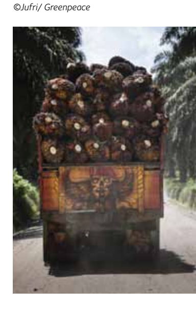
May 2013, Riau Transport of oil palm fruit by a truck to a crude palm oil processing mill owned by RSPO-member Asian Agri. A report by WWF documented trade in fresh fruit bunches from illegal plantations inside the Tesso Nilo forest complex to this mill as recently as 2012.

Thus, even among the RSPO's own members, dirty palm oil remains the common currency – RSPO standards are inadequate, poorly enforced and offer palm oil consumers no guarantee that the oil they buy has been produced responsibly.