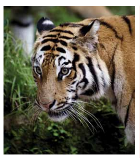
March 2013: Sumatran tiger Deforestation by the palm oil sector is destroying critical tiger habitat.

Some palm oil producers are showing leadership. Companies that have 'gone beyond the RSPO' and committed to policies to ensure forest protection include Golden Agri-Resources, <sup>50</sup> New Britain Palm Oil<sup>51</sup> and Agropalma, <sup>52</sup> whose 'no deforestation' commitments demonstrate that a responsible palm oil sector is possible. Meanwhile, some consumer companies are setting standards for truly responsible purchasing policies. For example, Nestlé has made a clear commitment to break the link between palm oil and deforestation in its own supply chain. However, it is important to monitor closely how these policies are implemented.