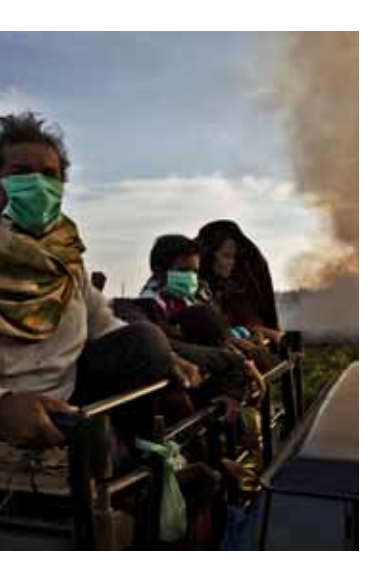
June 2013, Riau Villagers wearing protective face masks drive through smoke rising from fires on recently cleared peatland in an oil palm plantation.