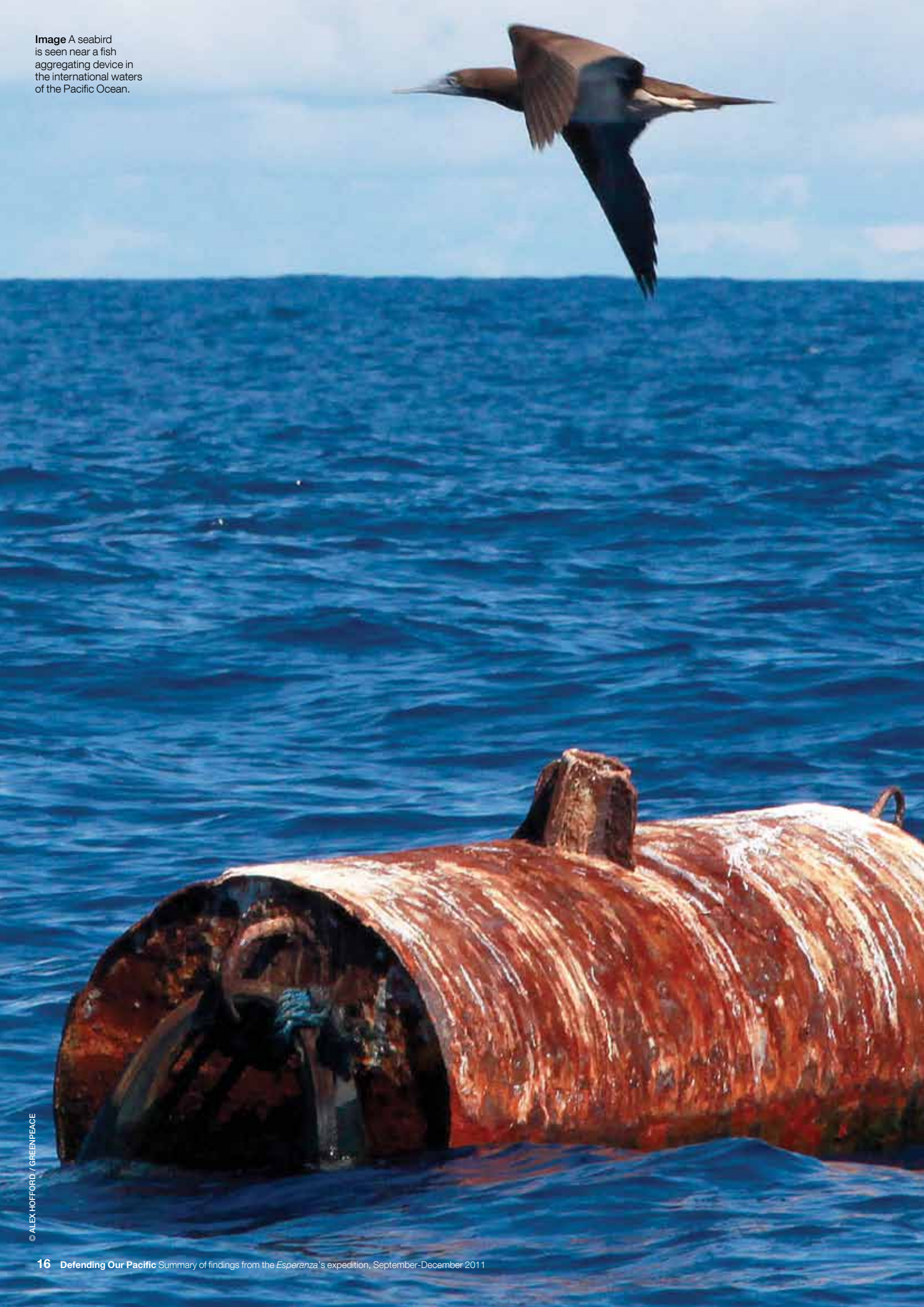
Image A seabird is seen near a fish aggregating device in the international waters of the Pacific Ocean.