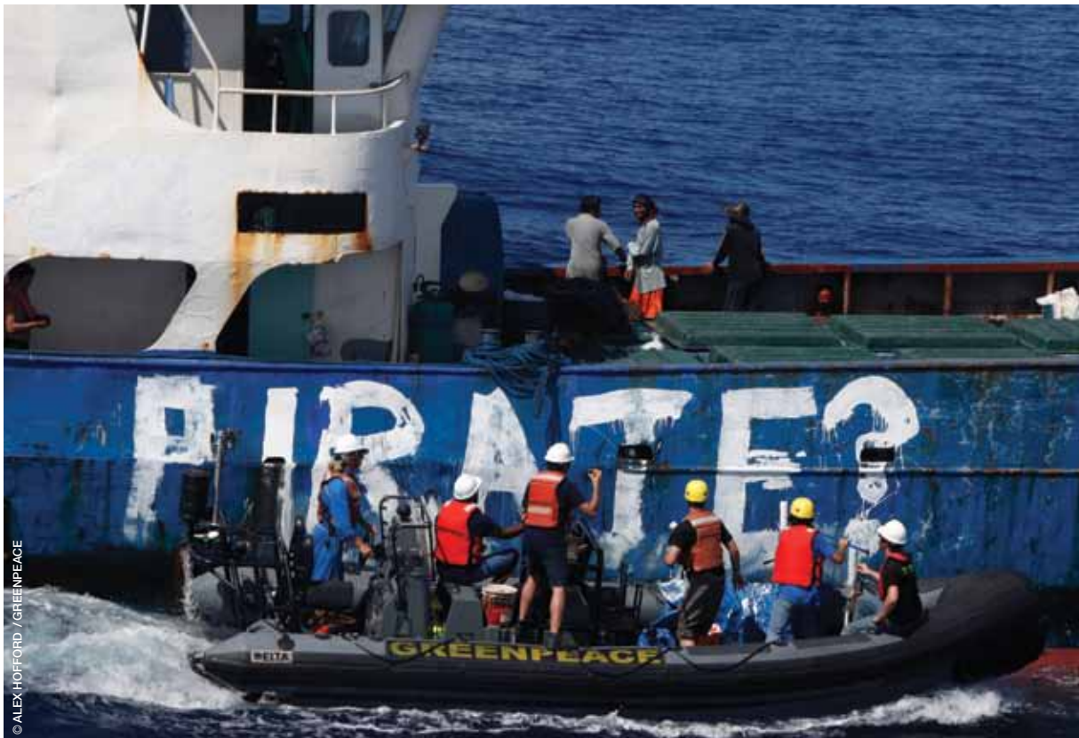
Image Greenpeace activists paint 'Pirate?' on the side of a reefer, or cold storage vessel, on the high seas close to the border with Indonesia's EEZ. The reefer was breaching international law by receiving a transhipment of large quantities of tuna from an IUU purse seine fishing vessel.

Within three days of a short joint enforcement patrol of the southwestern area of Palau's EEZ conducted by the Esperanza and Palau's only patrol boat, no less than eight fishing operations were encountered, including five apparent IUU cases. These included two IUU unmarked reefers, an unmarked operation involving a bunker reefer and support vessels, and two non-reporting longliners – one of which was documented fishing for sharks in contravention of Palau's shark sanctuary. Only one of the longline vessels was apprehended and escorted back to Palau port for investigation. Details and documentation of all vessels encountered during the joint operation have been passed to the Palau authorities for further investigation and action.