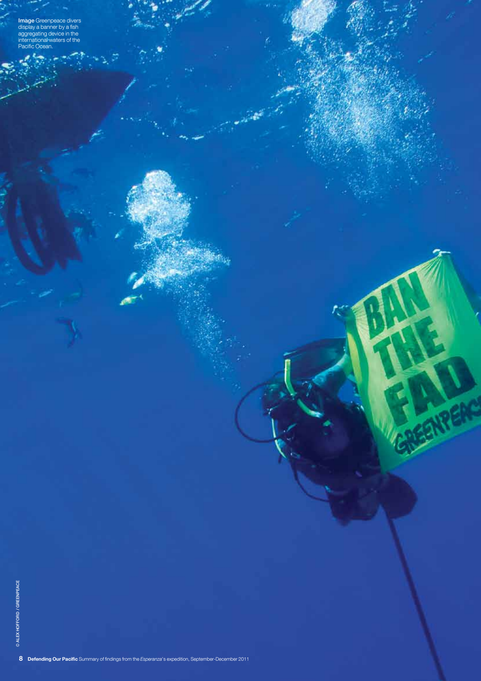
Image Greenpeace divers display a banner by a fish aggregating device in the international waters of the Pacific Ocean.