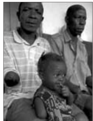
Liberian logging companies such as RTC and OTC helped fuel one of west Africa's most cruel civil wars