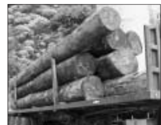
Summer 2001, Italy – DLH imports of OTC logs