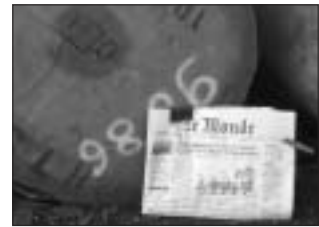
January 2002, Sète, France – RTC logs purchased by DLH

DLH has sold Brazilian mahogany to companies that have in turn supplied New York's Museum of Natural History; many US and Canadian embassies around the world; and high-profile companies like the UK's Harrods department store and John Lewis Partnership. 65