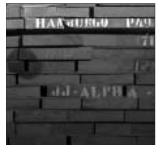
February 2002, Hamburg Germany – post-ban mahogany exported by Jatoba for DLH