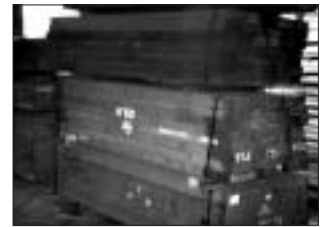
December 2001, UK – Hazim timber imported by DLH for UK timber trader James Latham

Criticism of OTC has been widespread in both the national and international press. Yet President Taylor continues to defend the company, and has responded to criticism by removing those who voice it from office and by the use of police intimidation and arrests.