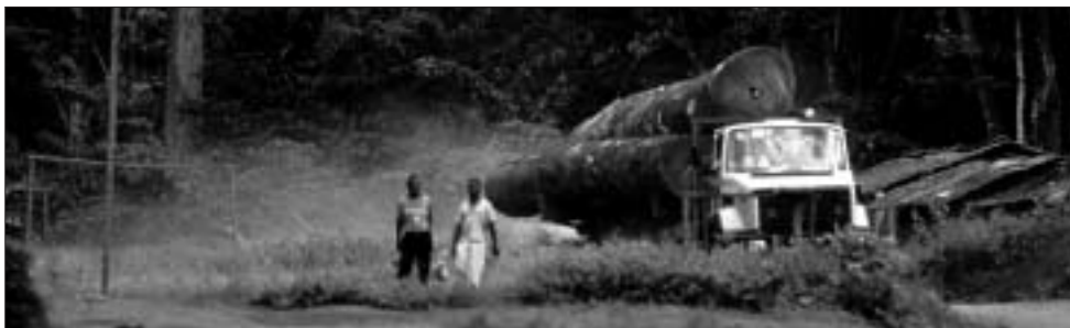
Cameroon's logging industry is dominated by illegalities – to the cost of the forest

Supplying this demand, and in a key position to influence the state of the world's logging industry, are the large transnational timber traders. Almost without exception, these powerful players have chosen knowingly to continue laundering timber from illegal and destructive sources, often from countries governed by corrupt regimes where rogue logging companies operate unhindered. They supply wood to complacent consumer countries in Europe, North America and Asia who turn a blind eye to its origins.