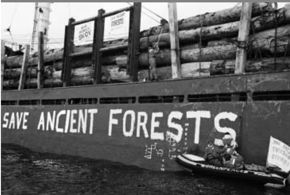
February 2002 – Greenpeace takes action in the French port of Sète to block the import of Liberian logs, some of which was destined for DLH