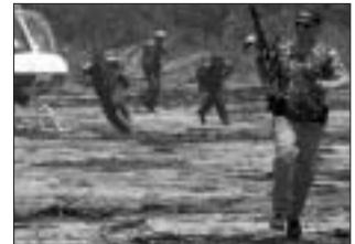
IBAMA seized some 21,000m 3 of illegal mahogany during Operation Mahogany between October and December 2001

Despite DLH stating that it needs "to work with the authorities (IBAMA) in Brazil and support them in strengthening control", 41 the company has continued to import mahogany linked to the Mahogany Kings, flouting IBAMA's Decrees and other efforts to stop the corrupt and illegal trade in Brazilian mahogany. 42