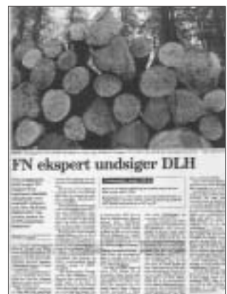
March 2002 – UNSC expert on arms trade refutes DLH's position on buying OTC timber in the Danish press

Throughout the world ancient forests are in crisis. Some 80% of the world's original ancient forest cover is already gone; illegal and destructive logging poses the single greatest threat to what remains. The uncontrolled international trade in ancient forest products fuels this destruction. As part of its campaign to protect what is left of the world's ancient forests, Greenpeace is carrying out investigations into logging companies involved in illegal, destructive and abusive activities and is calling on consumers, trading partners and governments around the world to stop their role in driving this unscrupulous industry.