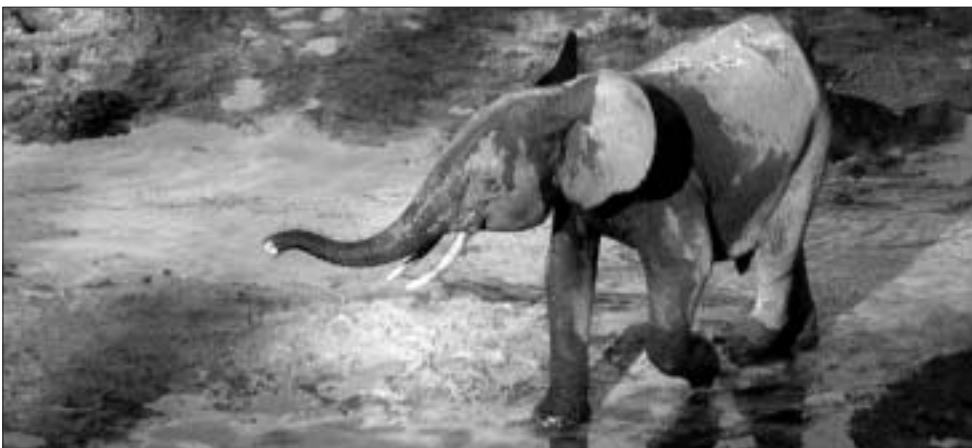
Liberia's threatened forests are the last stronghold of the forest elephant in West Africa

“A disastrous partnership of loggers and hunters in the Congo basin ... [means that] in as little as ten years ... the world's second biggest tropical forest could be emptied of large mammals; and Africa's great apes – gorillas, chimpanzees and bonobos – could become extinct.” The Economist , 12 January 2002