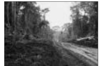
July 2001 – new logging road in East Cameroon

In Cameroon, DLH is buying from numerous companies involved in illegal logging operations, including the country's most notorious logging company – Société Forestière Hazim – and several companies of the Vicwood-Thany group including SEBC and CFC. These companies have been fined millions of Central African Francs (CFA) for their repeated involvement in illegal forest practices over the last two years. 46 However, these fines represent only a tiny fraction of the estimated revenue of which these companies' illegal activities have defrauded the Cameroonian government. For example, an independent team of experts has calculated that the export value of the illegally cut timber in just one area where Hazim has been logging amounts to more than US$26 million. 47