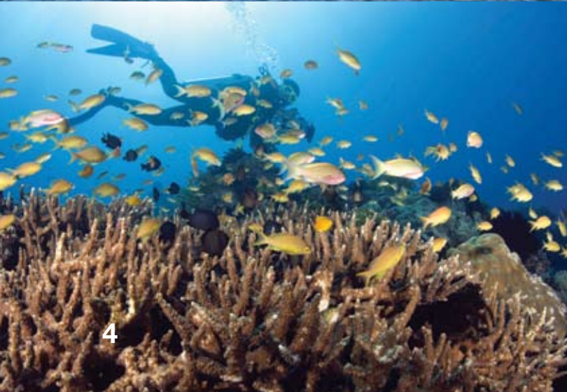
Isla Apo, Filipinas

Regarding accommodation: big hotels produce more emissions than pensions, apartments with a kitchen or than the camping fields. This is due to their bigger energy consumption so to keep their facilities functioning. The emissions of the tourist activities are directly related to the quantity of energy of fossil fuels that these activities consume. For example, aquatic ski produces more emissions than hiking, and the thematic parks produced more emissions than rafting 4 . Likewise, it had been estimated that the emissions from tourism will grow at a rate of 150 per cent between 2005 and 2035, if no measures in order to reduce them are taken.