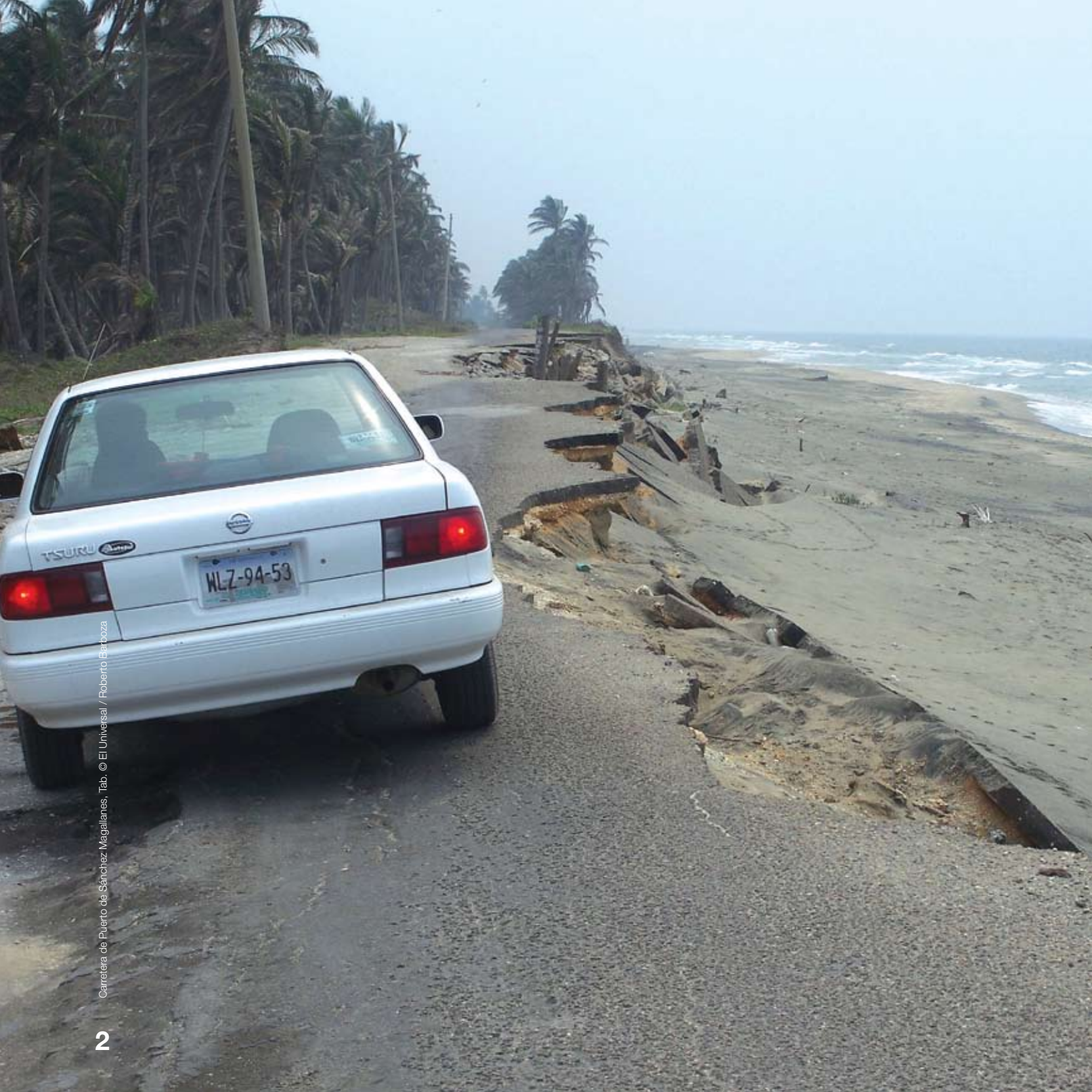
Carretera de Puerto de Sánchez Magallanes, Tab.