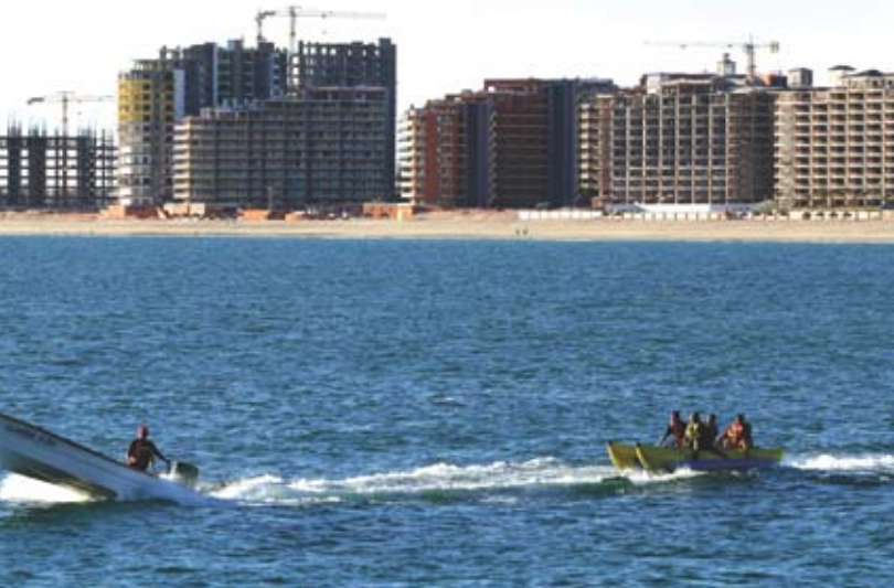
Puerto Peñasco, Son.