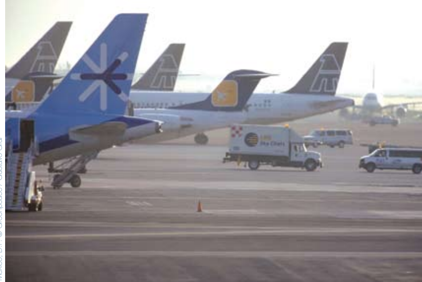
México, D.F.