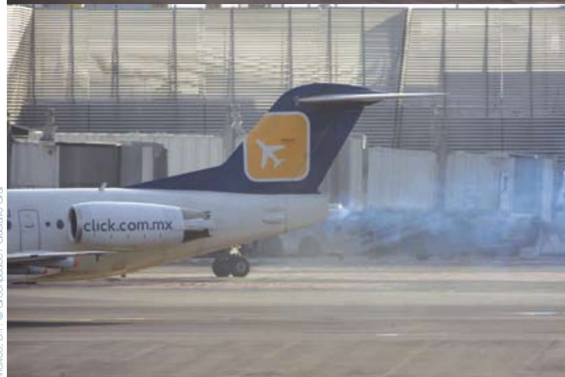
México, D.F.