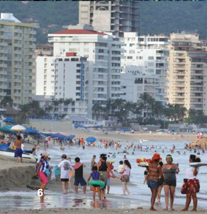
Acapulco, Gro.

Water is other concern, as well as the desertification which is affecting several areas in the world. In semidesert areas there is a ferocious competition for obtaining this resource. Here, there is a struggle between the water necessities of the local communities and the ones of the tourist development, because the water consumption of the visitors is greater than the one from the residents 10 .