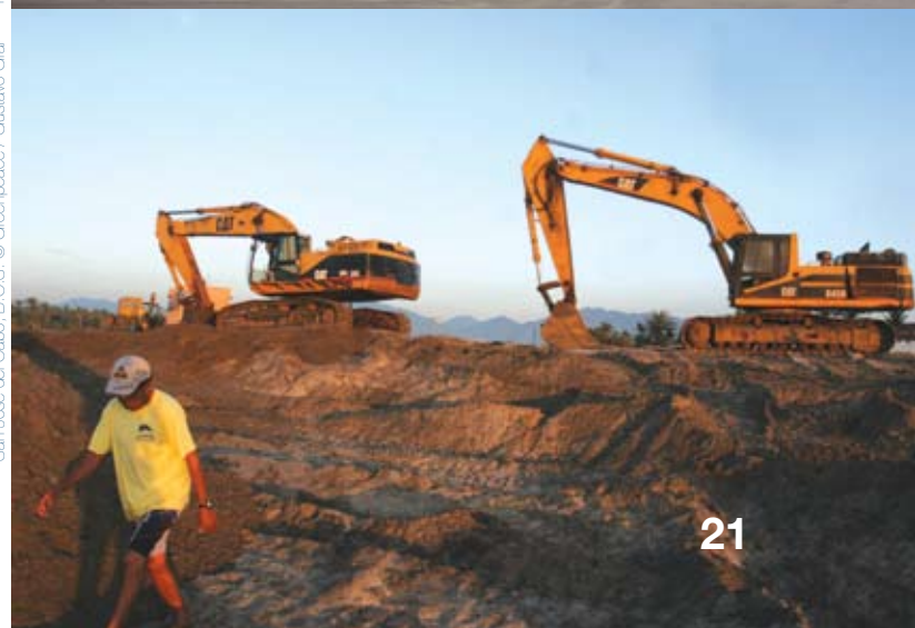
San José del Cabo, B.C.S.