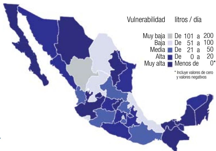
Figure 2. Absolute differences in water consumption per inhabitant during 1990-2025 (liters/day). There are two mayor value groups: negative and positive. Negative values in the absolute differences of water consumption during 1991-2025 mean that, due to the fast population growth, in the future there will be water scarcity, which force a reduction of the daily water consumption per inhabitant, that is the daily water consumption per inhabitant in 1990 needs to be greater than the one in 2025. The positive values show all the contrary, according to the nowadays tendencies, in the aforementioned states will be possible to increase the quantity of water for consumption per inhabitant, therefore, water consumption in 1990 will be less than in 2025.

Nevertheless, water demand is still increasing due to the building of hotels and golf courses. In 2007, 43 golf courses were open in the coastal states of California Gulf: nine in Baja California, 13 in South Baja California, seven in Sonora, seven in Sinaloa, seven en Nayarit. Of these golf courses, only seven are not located in the coast and associated to sun and beach destinations. It has been estimated that 27 new golf courses are going to be built and planned, which will add a total of 70 golf courses in the area in the next five years. This represents a huge demand of water: in average, each golf course uses 10 thousand liters of water per day.