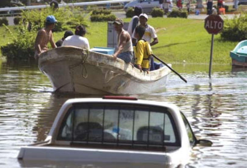
Villa Hermosa, Tab.