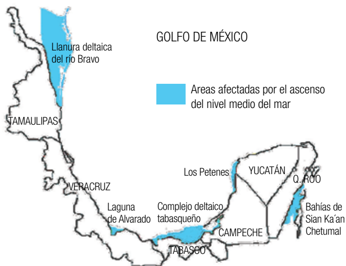
Figure 1. The five areas which are susceptible or vulnerable to the increase or decrease of the sea level. 18

the Cardenas municipality, located next to Barra de Santana, houses, schools, shops, restaurants, and streets running along the beach had been damaged, and many of them were rundown 19 .