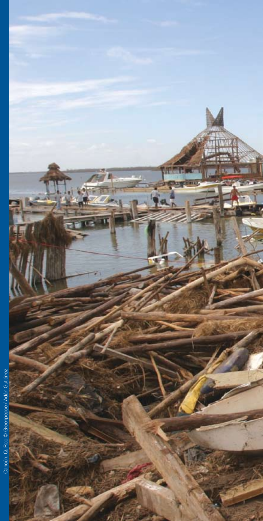
Cancún, Q. Roo