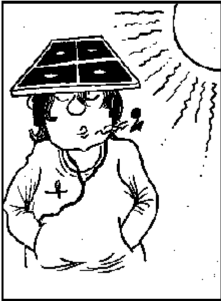
Cartoons Courtesy CSE India