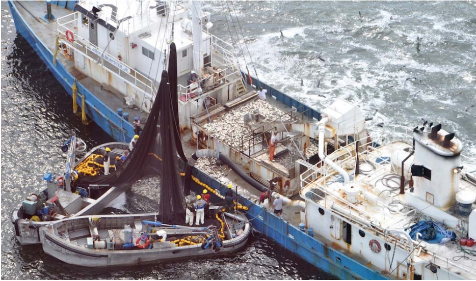
There is no coastwide limit on the amount of menhaden that can be removed from the population by the fishery. In 2010, the industrial reduction fishery, which grinds menhaden into fish meal and oil, harvested over 400 million pounds of menhaden, about half of which was taken from the Chesapeake Bay.