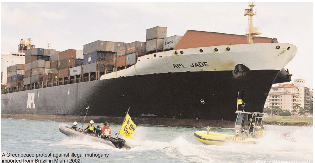
A Greenpeace protest against illegal mahogany imported from Brazil in Miami 2002.

Pará is the source of more than 70 percent of all Amazonian wood imports to the United States. Currently the U.S. has no system in place that can help distinguish between those companies that operate within the law, and those that do not. viii