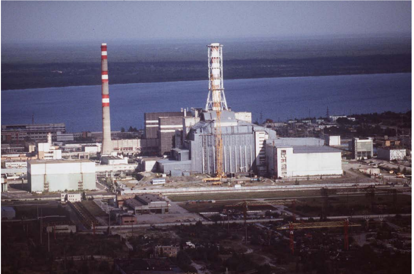
Above: Chernobyl nuclear power plant. September 1996.

Preceding page, top: Pripyat, the deserted city a few kilometres from the Chernobyl nuclear power plant. The city was a “Soviet dream” with a sports stadium and swimming pool. December 1995.