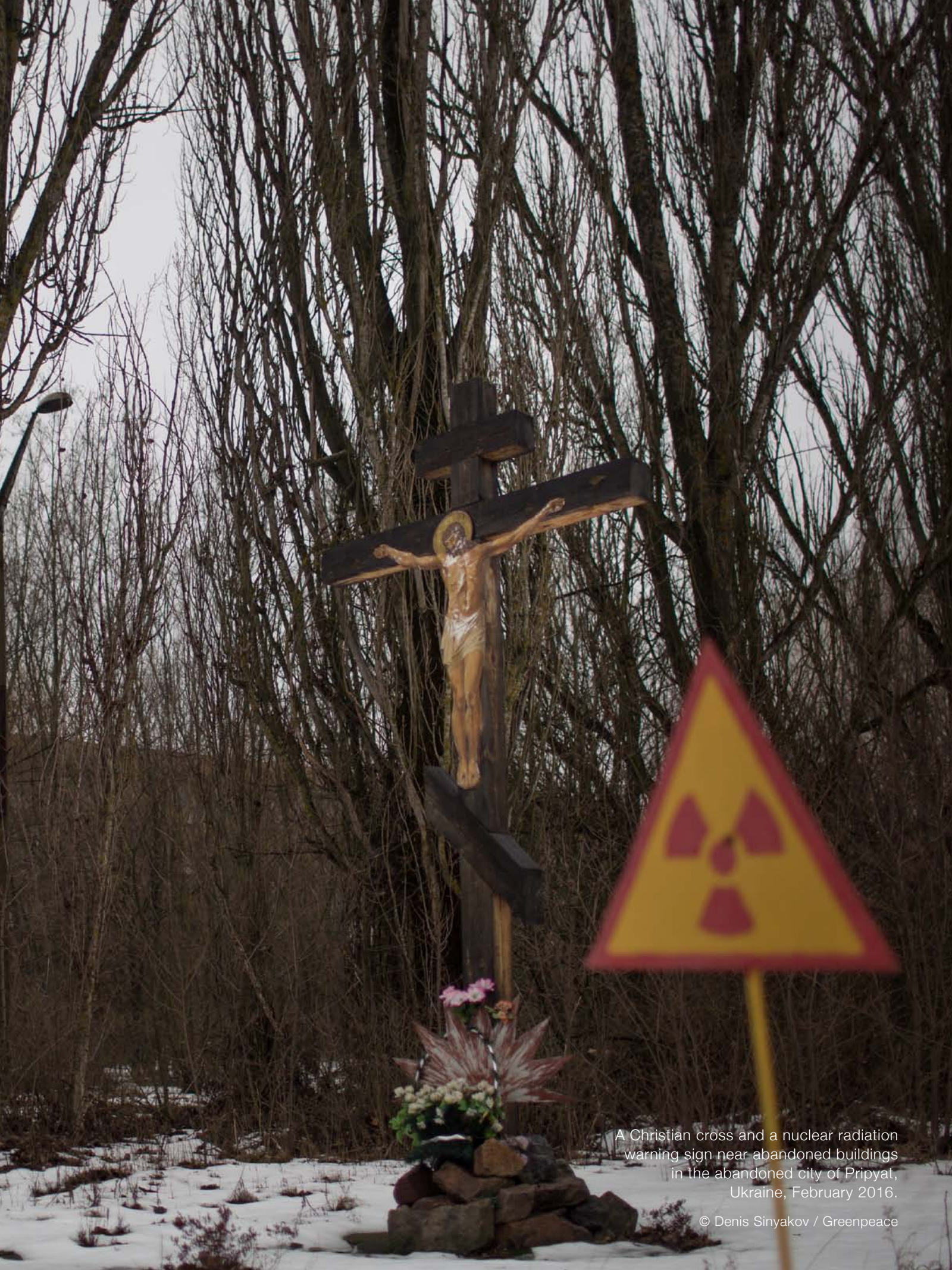
A Christian cross and a nuclear radiation warning sign near abandoned buildings in the abandoned city of Pripyat, Ukraine, February 2016.