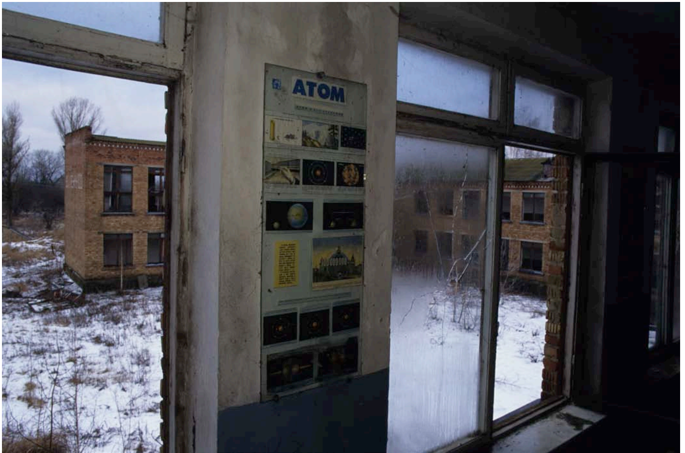
Chemistry laboratory in deserted secondary school, Illinsty, Ukraine. December 1995.