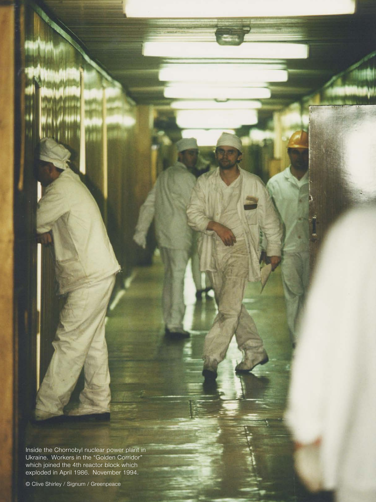
Inside the Chernobyl nuclear power plant in Ukraine. Workers in the "Golden Corridor" which joined the 4th reactor block which exploded in April 1986. November 1994.