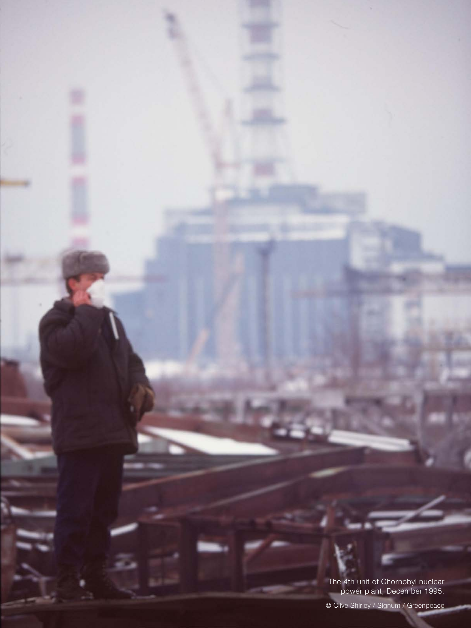
The 4th unit of Chernobyl nuclear power plant, December 1995.