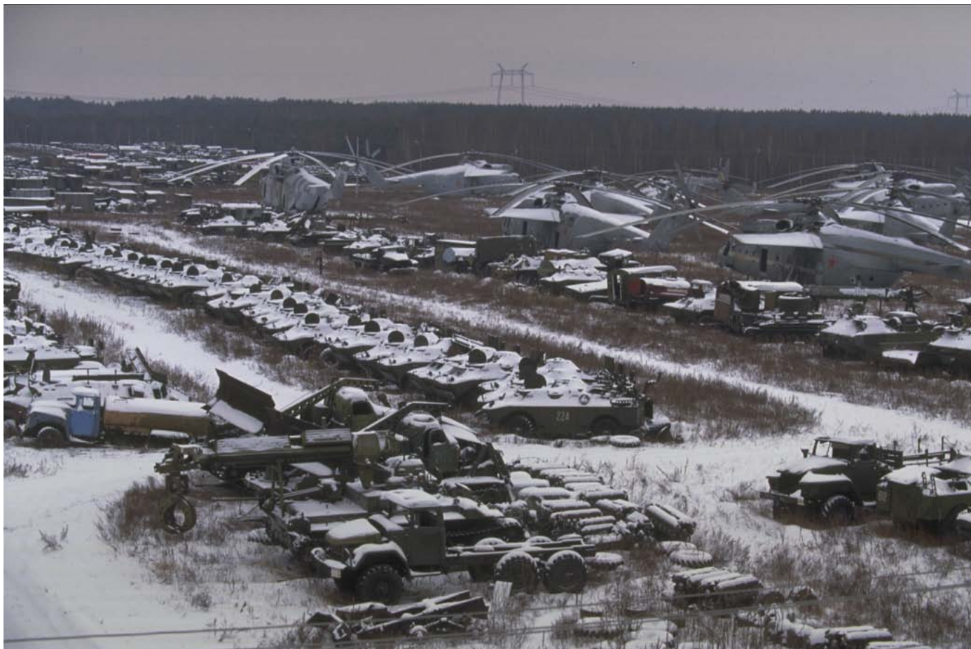
The biggest dumping area of contaminated vehicles and helicopters used for combatting the catastrophe of Chornobyl, in Rassohka, Ukraine, December 1995.