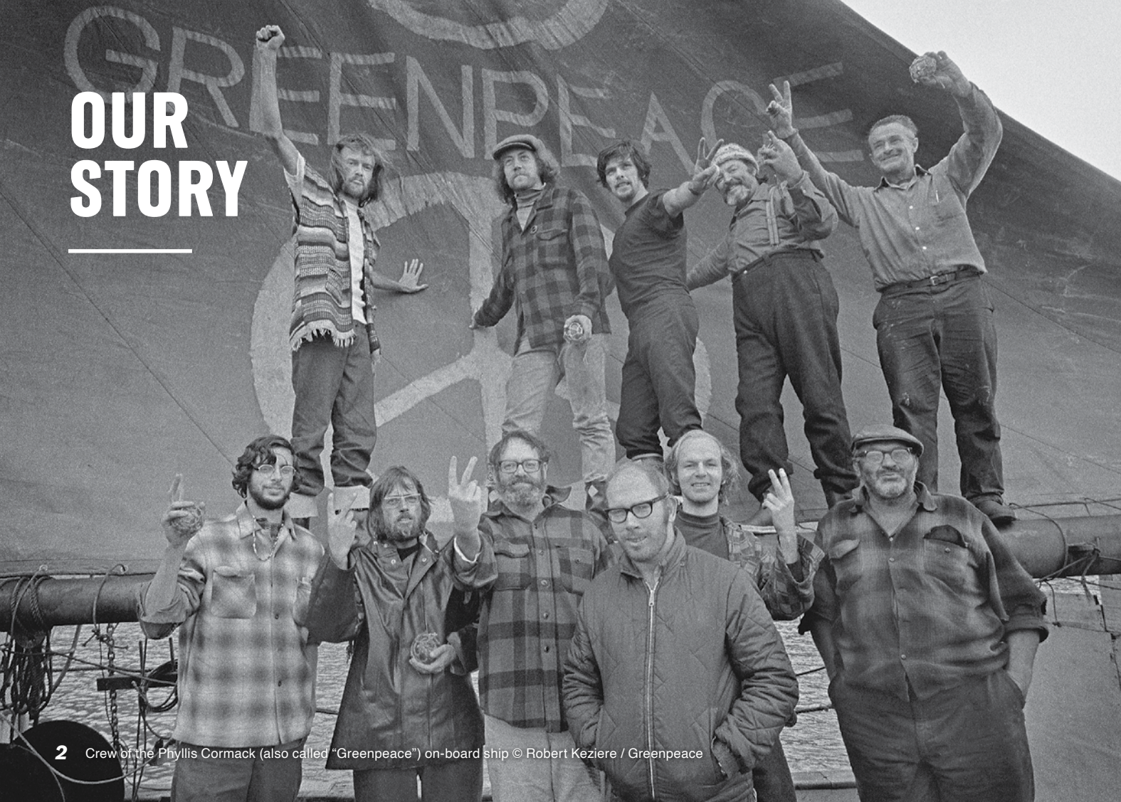
2 Crew of the Phyllis Cormack (also called "Greenpeace") on-board ship

From our beginnings as a small group of ordinary people in 1971 , protesting against nuclear testing off the coast of Alaska, Greenpeace has grown into a global movement for change. Today, you are part of a global Greenpeace - a vital crew of supporters, scientists, sailors, researchers, lobbyists, lawyers and activists in 55 countries around the world, peacefully doing whatever it takes to protect our planet.