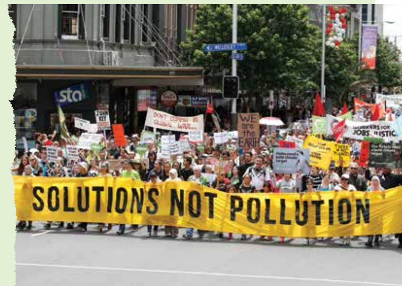
15,000 New Zealanders take part in the People's Climate March in Queen St, Auckland

Together, we've defied the nuclear arms race. We've stood between whales and harpoons. We've protected Antarctica. We've saved rainforests from the chainsaw, and stopped toxic waste dumping at sea. But there's still so much to be done.