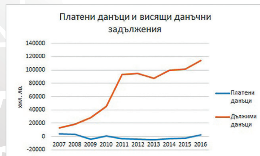
Graphic 2: Paid taxes and outstanding tax liabilities, in thousands BGN

• Outstanding tax liabilities worth of more than 58 million euro. This fact goes hand in hand with “tax neutrality”: the group is predominantly working at a loss, and since the Bulgarian companies are eligible to deducting losses from future profits, the total tax bill turns out to be a negative sum. In other words, corporate taxes constitute revenues and not expenses for this structure – taken as a whole, 5 million euro for a period of ten years.