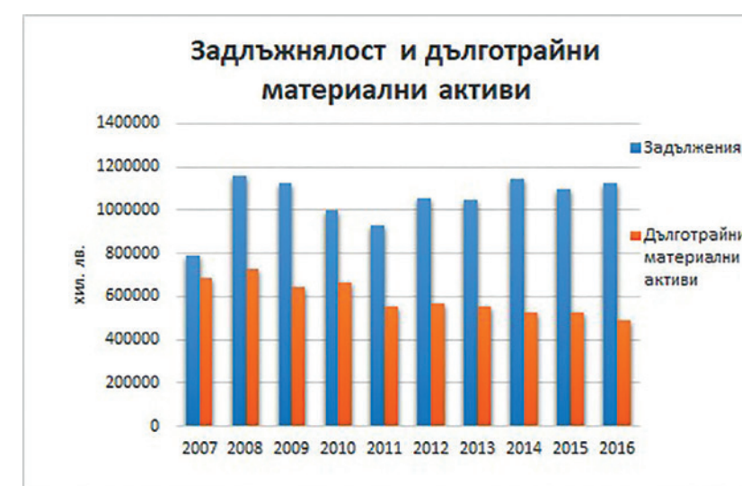
Graphic 3: Accounts receivable and long-term assets, in thousands BGN

• Taken as a whole, the assets of this group incase – only due to rising accounts receivable. The outstanding accounts receivable stay at 275 million euro as of 2016. For such a closely integrated and secretive business structure it is doubtful whether its current assets correspond to real business operations. Some of the companies’ auditors raise this question in their accompanying reports – a rarity for the loose Bulgarian accountancy regime.