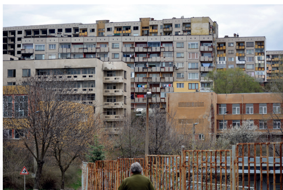
What is the future of Bobov dol beyond coal?

The labor unions are concerned predominantly with the melting jobs and take no solid stance. At least, one of the labor’s leaders in TPP Bobov dol (which presumably is in much better financial health than the mine) approached the problem in 2017: “The remuneration has never been regular... The salaries are late by 2-3-4 months. Working clothes have not been distributed for 3-4 years.” xxiv