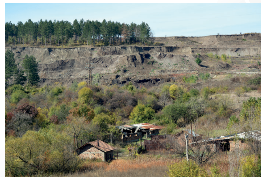
Coal should stay in the ground

The alternative scenario has its name and it is the Rule of Law. It implies nothing more than respecting the public financial interests, enforcing environmental protection laid down by law, and showing empathy towards workers' conditions. Such simple aim for Bulgaria would require much efforts in the coming decades, but the process may start even today – by abandoning the unlawful price subsidies, standing for the human rights of the miners, and imposing adequate measures against the air polluters.