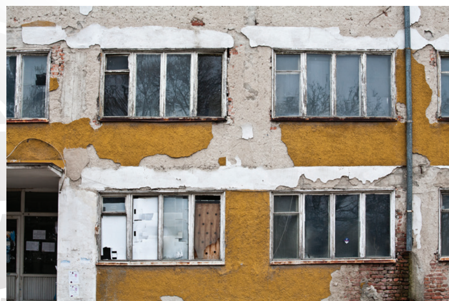
The town on Bobov dol – once in the heart of coal mining in Southwestern Bulgaria.

Our financial analysis revealed that this "empire" now undergoes a deep decline, with piled-up liabilities amounting to 575 million euro as well as highly depreciated and obsolete production facilities. Liquidation of some of its assets is on the table, as is already the case with some of the coal mines, including the underground parts of the Bobov Dol mine. Issues such as mass dismissals of employees leading to unemployment of entire municipalities as well as doubtful rehabilitation of old mines would certainly emerge. The vested interests during the creation of this business structure imply that public interests may be disregarded once again when dealing with the business structure's imminent demise iii .