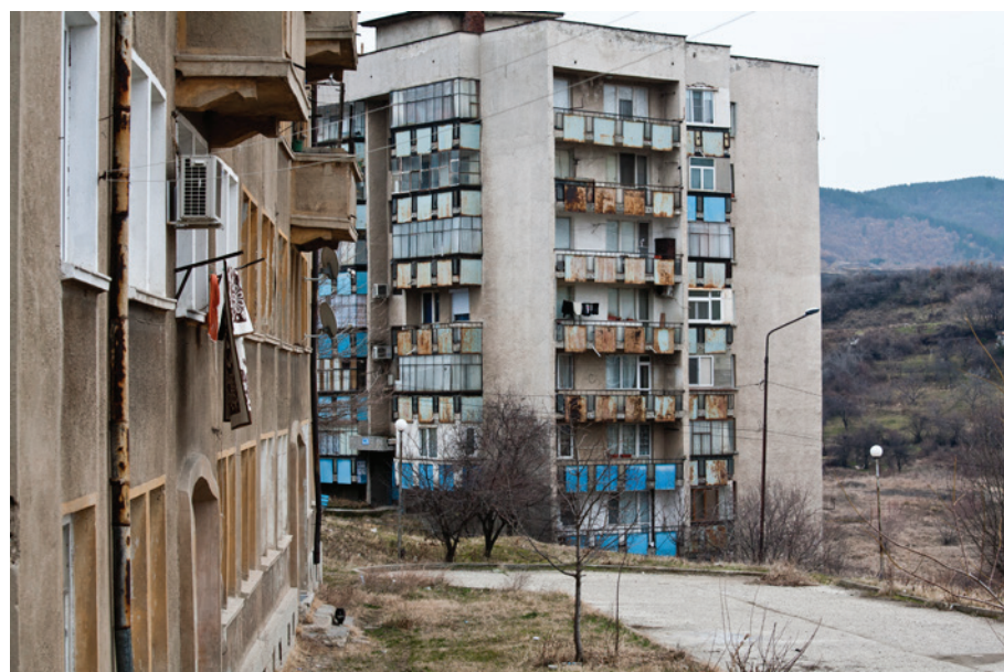
The town of Bobov dol – scarred for life by coal

By consolidating the ten-year results of these 19 companies, we came to the conclusion that this structure adopted the “milking” business strategy : taken as a whole there are no investments in expansion or modernization, and the means of production are exploited to their physical end. In some cases, the business strategy takes on the “vulture prey” form – the companies are deliberately liquidated, and their assets sold by the pound to avoid riots provoked by lost jobs.