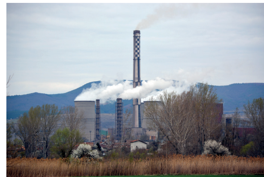
Polluting coal power plants should be thing of the past

This lightly covered up state aid does not exhaust all the benefits that this “coal empire” draws from public funds. During peak consumption in the winter months, the energy system pays some power plants for spare capacity – the so called “cold reserve” which is activated only when a deficit in the system emerges. All three TPPs – Brikel , Bobov Dol and Maritsa 3 take part in this scheme. And all three of them failed when it became necessary to activate the cold reserves during the bitterly cold January of 2017. In spite of that, the companies received public money for being reliable in full.