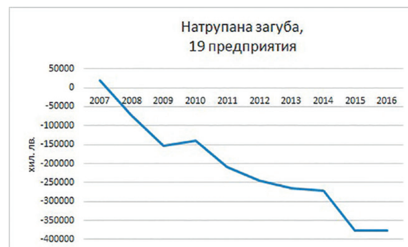
Graphic 1: Financial losses of 19 companies (2007 – 2016), in thousands BGN

For the period of 2007 – 2016, the companies in question had declared combined net revenues of 3.7 billion euro. According to the financial accounts, these are losing businesses – as of 2016, the group had already piled up an accounting loss of 184 million euro .