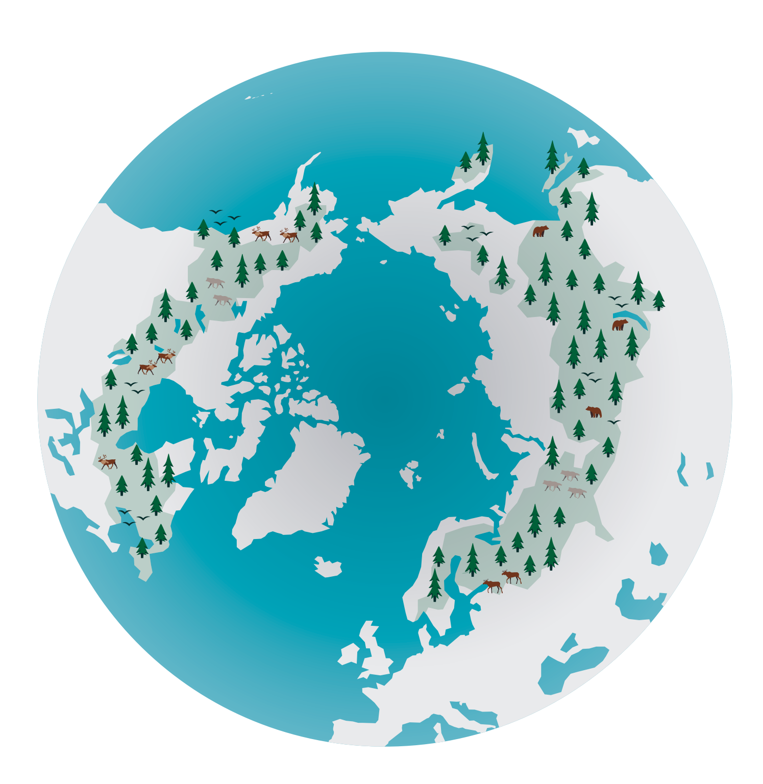
Fig. 1 The Great Northern Forest (GNF) consists of vast areas of boreal forest landscapes that stretches from Alaska, through Canada and Scandinavia, all the way to Russia (Copyright: Greenpeace).