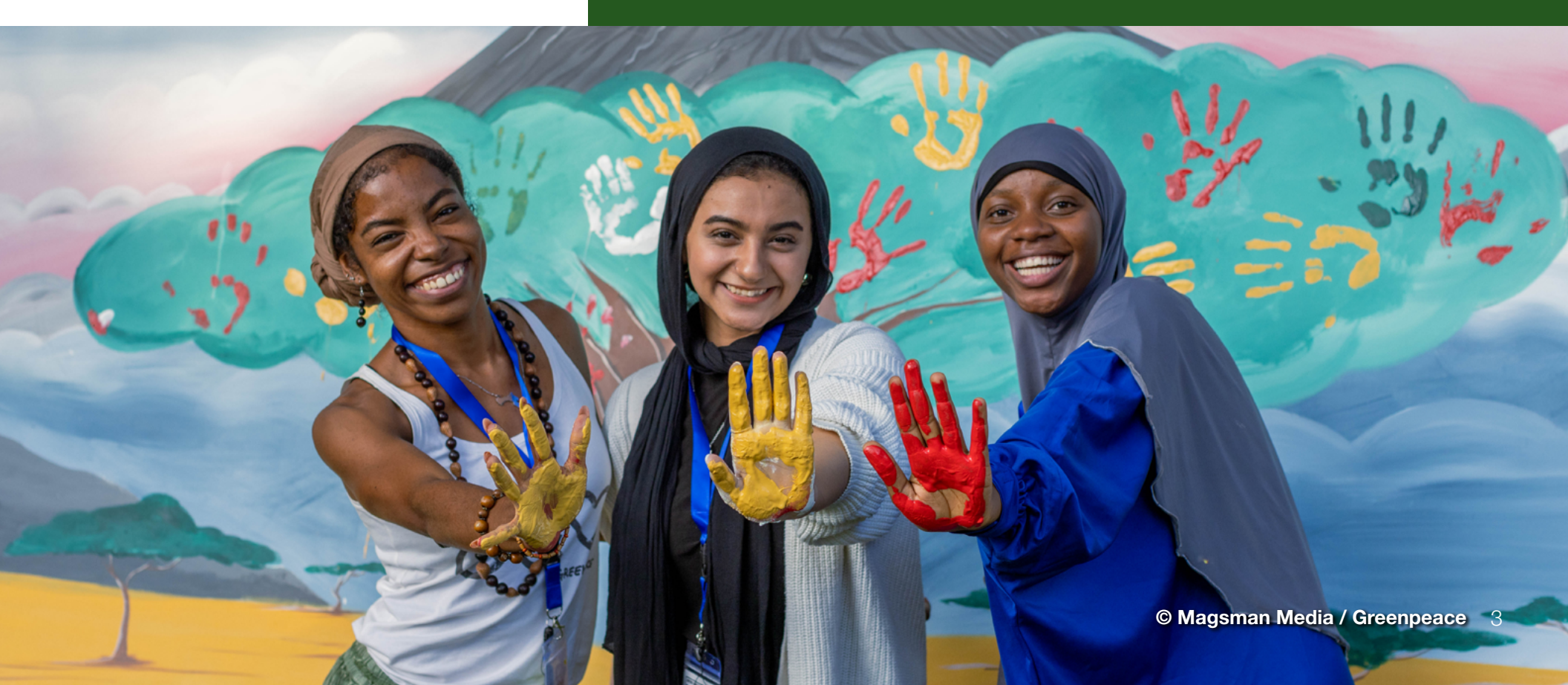
Promoting public engagement