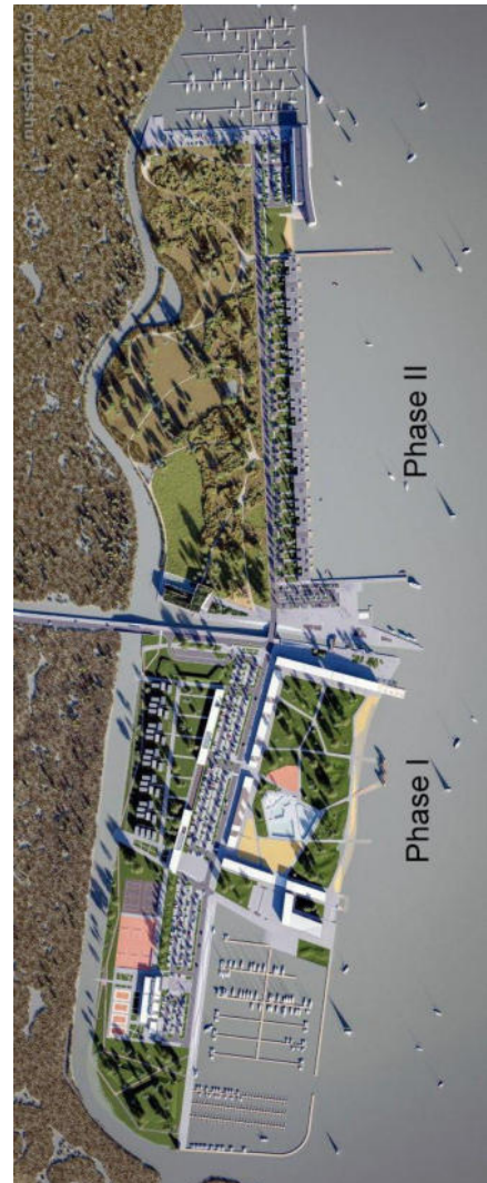
Presentation of “Sopron Fertő Lake Resort” Phases I and II