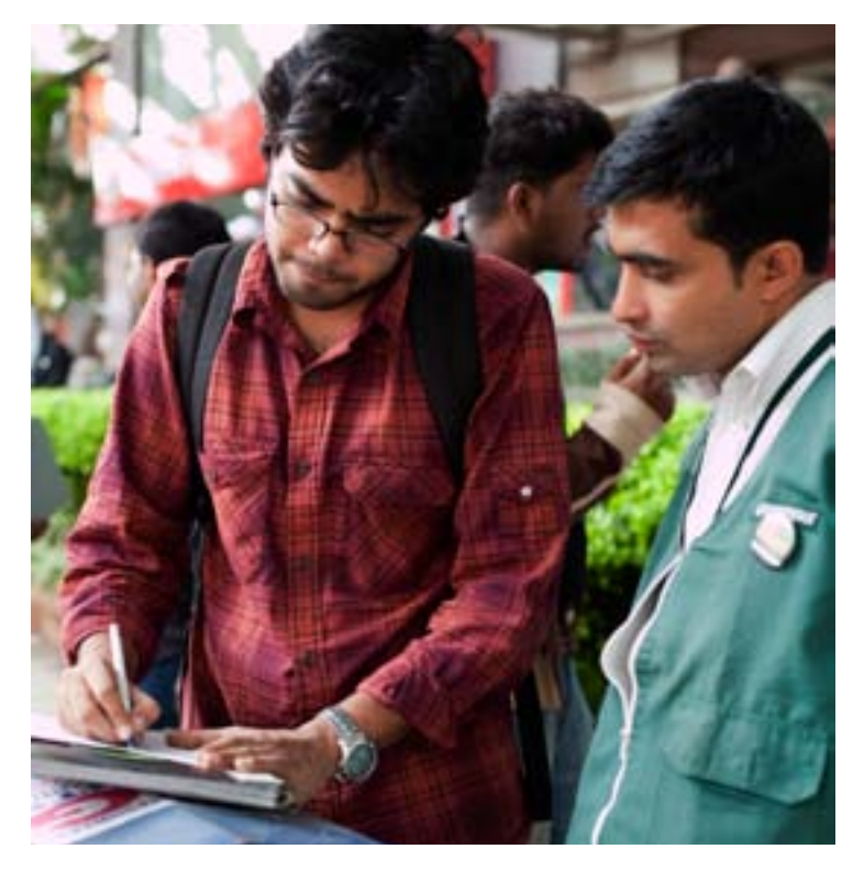
Image: A young man signs up with Greenpeace as a result of direct dialogue by a Greeenpeace employee

As environmental challenges grow larger and more pressing, we will need more financial resources to fund our campaigns. We need to strengthen what we know and at the same time, find new and innovative ways to bring in more people to support Greenpeace and its noble efforts. Here's to another year of learning, earning and fun!