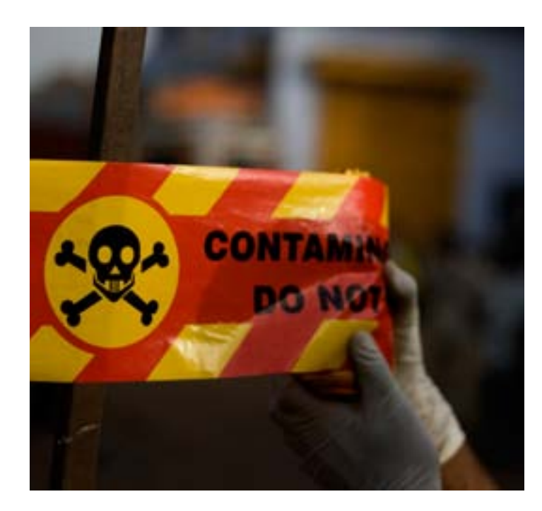
Image: Radiation from a Cobalt 60 source killed one person and injured six persons in west Delhi metal scrap market of Mayapuri. The International Atomic Energy Agency termed it as a Level 4 accident.

irradiators are used for sterilisation or decontamination and the process exposes products or substances to gamma rays, the most common source of which is the radioactive material Cobalt-60.