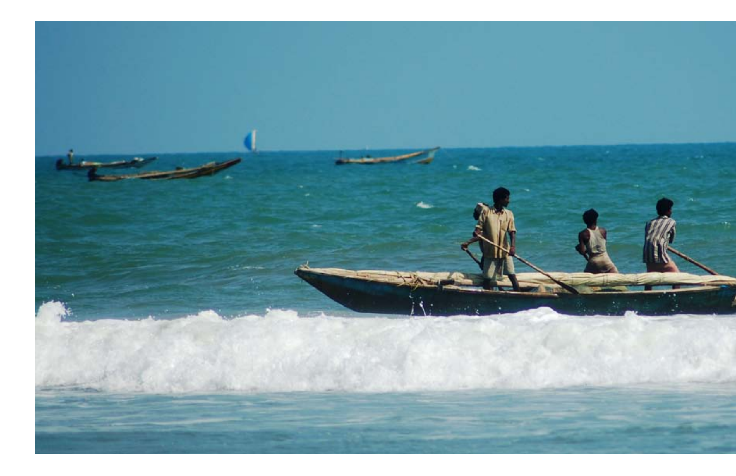
Image: With over 15,000 fishermen depending on marine resources in the region, it is conceivable that a more integrated approach between fisheries and conservation would serve both livelihood and marine management purposes better