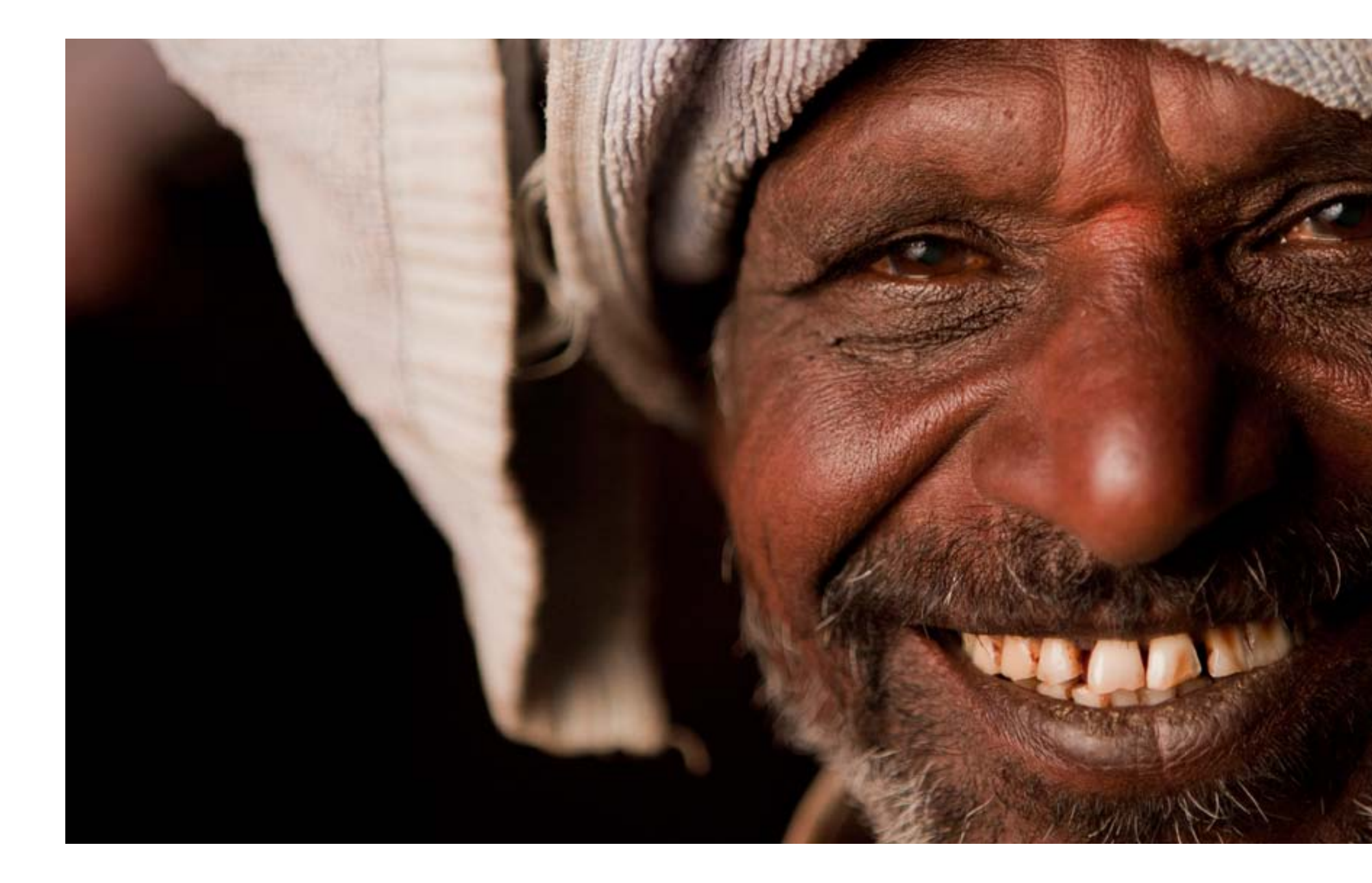
Image: A forward looking ecological fertilisation policy can bring back life in soils and smiles on the farmers' faces