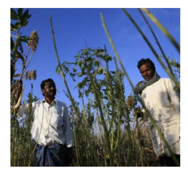
Image: Multiple cropping involving different crops helps to improve soil health

along with local groups, where all relevant stakeholders of the region participated. The findings and recommendations were discussed at a national workshop in Delhi on December 13, 2010, which saw participation from farmer groups, agriculture scientists, civil society organisations and government representatives.