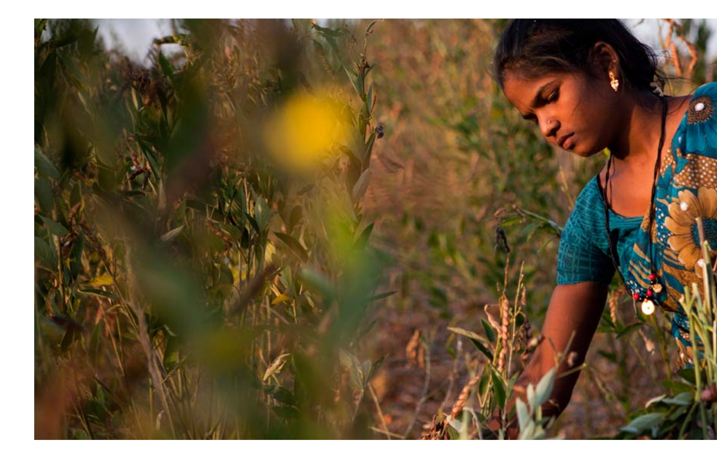
Image: Cultivation of legume crops can bring down the dependence on synthetic nitrogen fertilisers. They are also a good source of proteins and help contribute to nutritional security