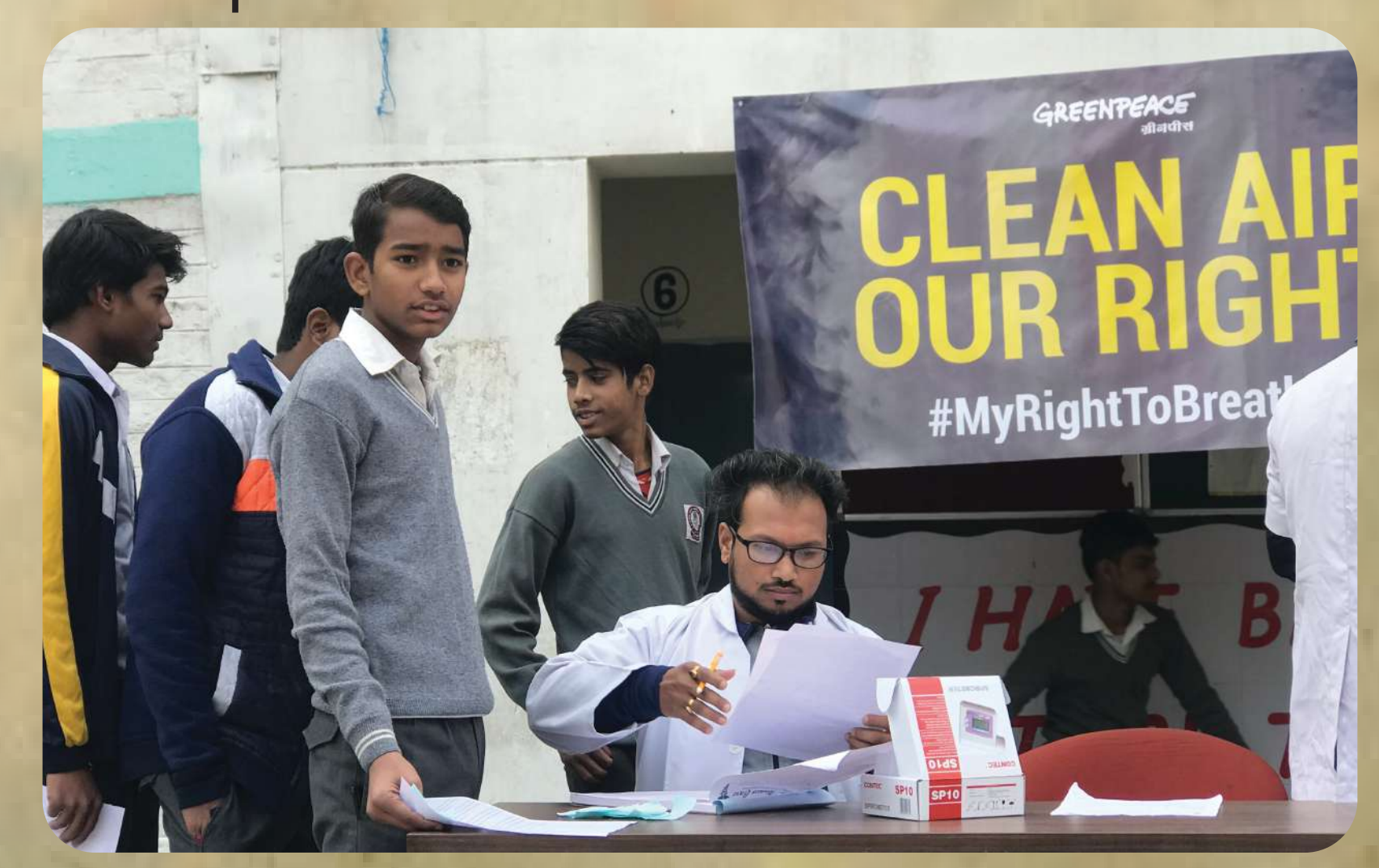
demand strict action compliance.

Precautions, like wearing anti-pollution masks and installing air filters, are available but they are not enough. If we hold the Our recent report revealed that while government publicly accountable, we can PM10 levels in the capital declined ensure that the National Clean Air Programme (NCAP) emission reduction targets are met. years, levels in 2018 are actually We must act as a watchdog to ensure that higher when compared to levels in thermal power-plants adhere to deadlines 2013, 2014 and 2015. Similarly,