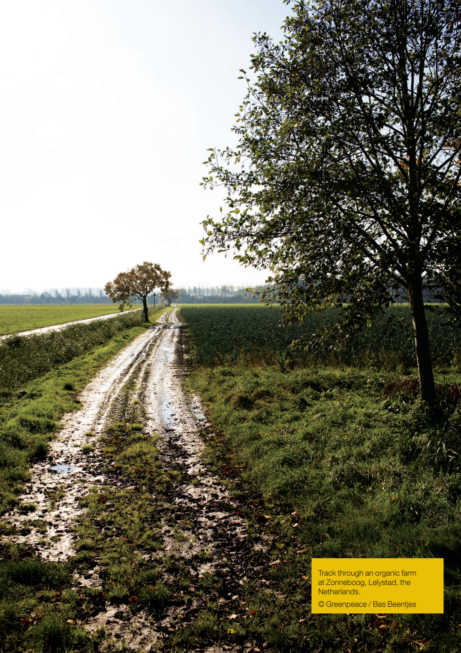
Track through an organic farm at Zonneboog, Lelystad, the Netherlands.