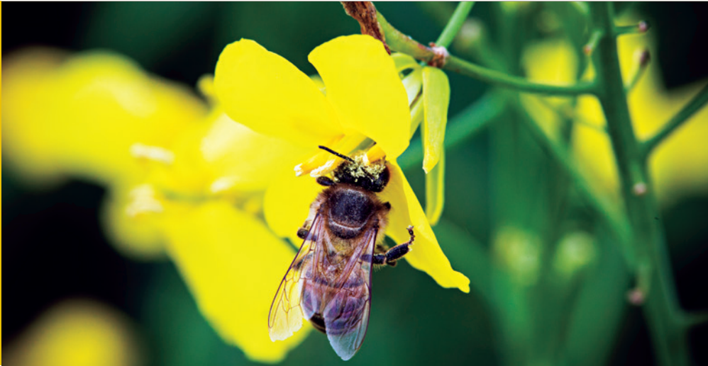
Bee collecting pollen from rape flowers, Germany.