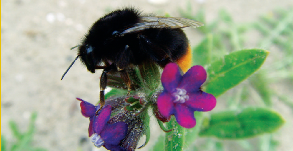
The red-tailed bumblebee ( Bombus lapidarius )