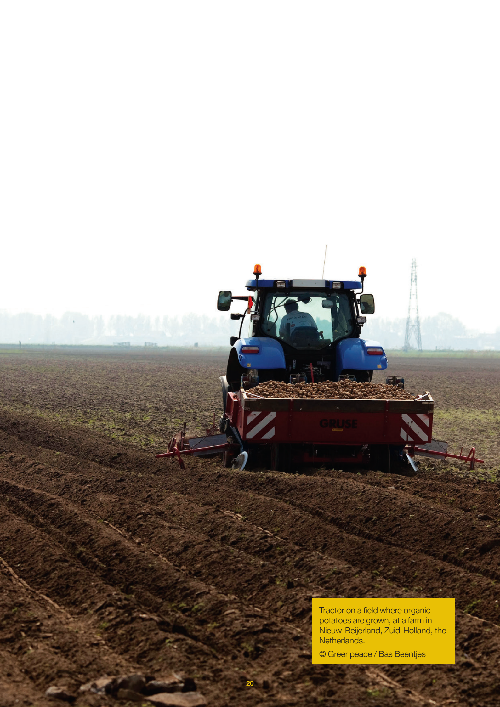
Tractor on a field where organic potatoes are grown, at a farm in Nieuw-Beijerland, Zuid-Holland, the Netherlands.