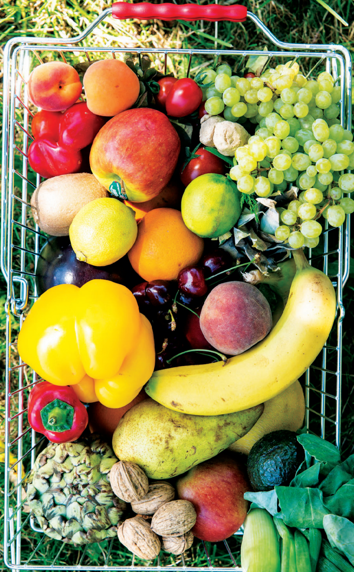
Fruit and vegetables that were pollinated by bees. Healthy bee populations are of ecological and economic importance.