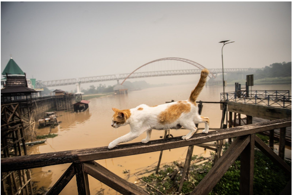
23 September 2019, Palangkaraya, Central Kalimantan.