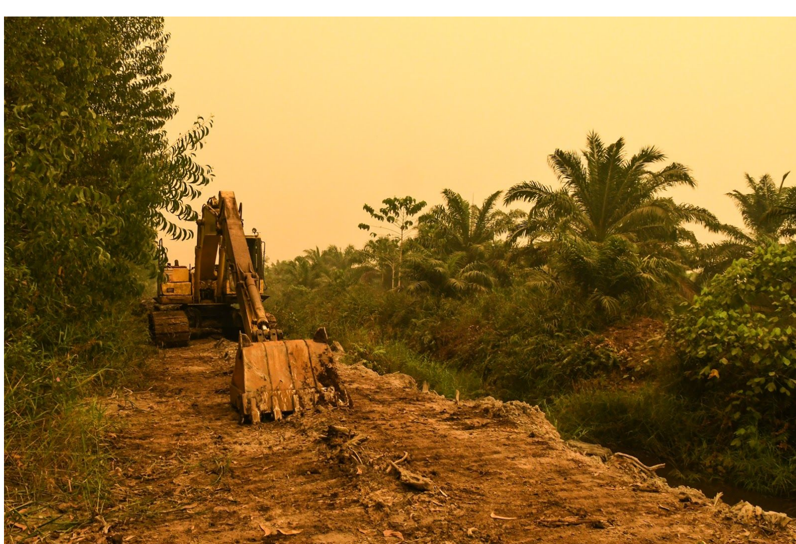
21 September 2019, PT Kaswari Unggul, 1°17'50.699" S 103°45'41.92" E: An excavator at work in the haze from peatland fires in the PT Bukit Barisan Indah Prima concession in Jambi. The plantation company is currently facing civil court action. PT Kaswari Unggul is named as a supplier to Unilever, Mondelēz, Nestlé and Procter & Gamble as well as Wilmar, GAR and Cargill.