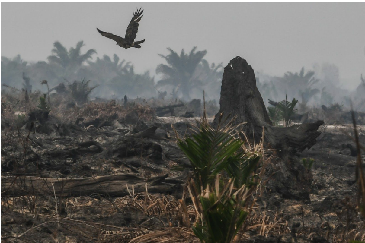
22 September 2019, PT Dyera Hutani Lestari, Jambi: An eagle ( Nisaetus cirrhatus ) flies over burned peatland.