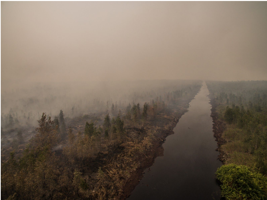
12 September 2019, PT Globalindo Agung Lestari, 2°29'7.12" S 114°34'46.03" E and 2°29'21.829" S 114°34'40.6" E: Drone footage of smoke rising from burning peatland forest over a drainage canal inside an oil palm concession owned by the Malaysian company Genting Plantations Berhad that has been sealed by the KLHK for investigation. All of the consumer companies and traders reviewed for this report are supplied by Genting.