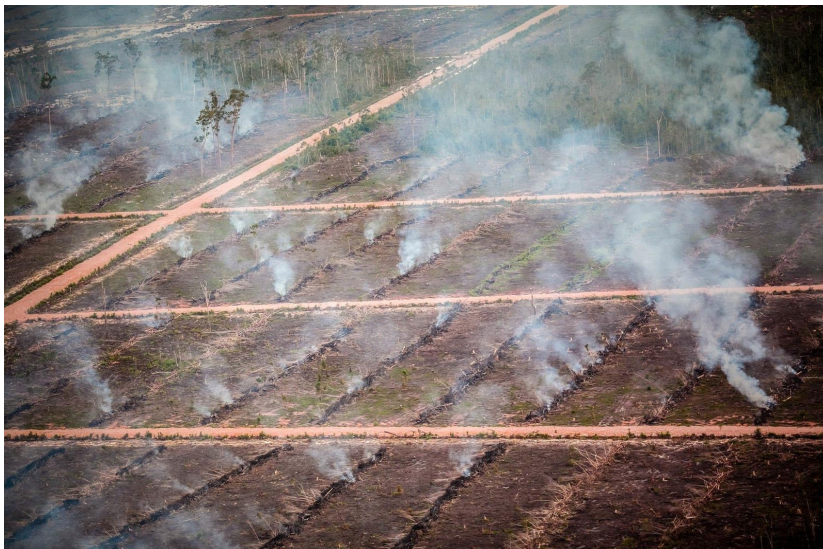
26 March 2013, PT Dongin Prabhawa, 7°20'9.79"S 139°45'30.946"E: Smoke rises from long rows of smoldering debris from forest clearance in Korindo's PT Dongin Prabhawa oil palm concession in Papua. Such woodrows and the proliferation of fires within them are strong indicators of deliberate use of fire. Nestlé's and Unilever's mill lists continue to show exposure to Korindo.

The burn scar area figures in this report have all been calculated on the basis of the government's burn scar data. While satellite imagery suggests that the government map may significantly overestimate burning in Korindo's concessions, Greenpeace's calculations have not been altered, for reasons of methodological consistency. Further, despite Korindo's assertions, the evidence remains that there has been extensive burning within Korindo concessions, with strong indications of deliberate use of fire.