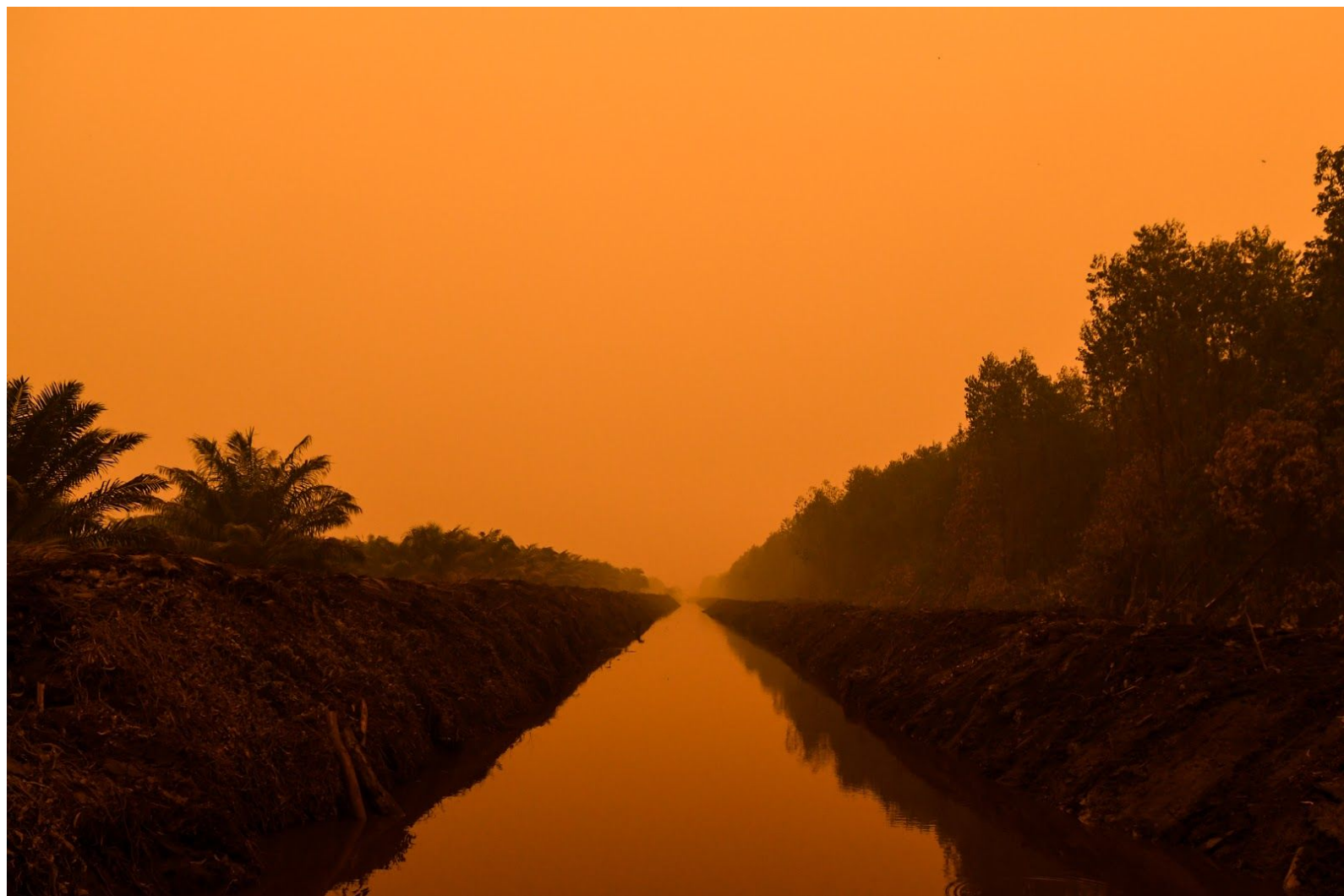
21 September 2019, PT Wira Karya Sakti, 1°19'3.979" S 103°45'30.499" E: A thick red haze surrounds a canal in burned peatland in a Sinar Mas Forestry pulpwood concession in Jambi.