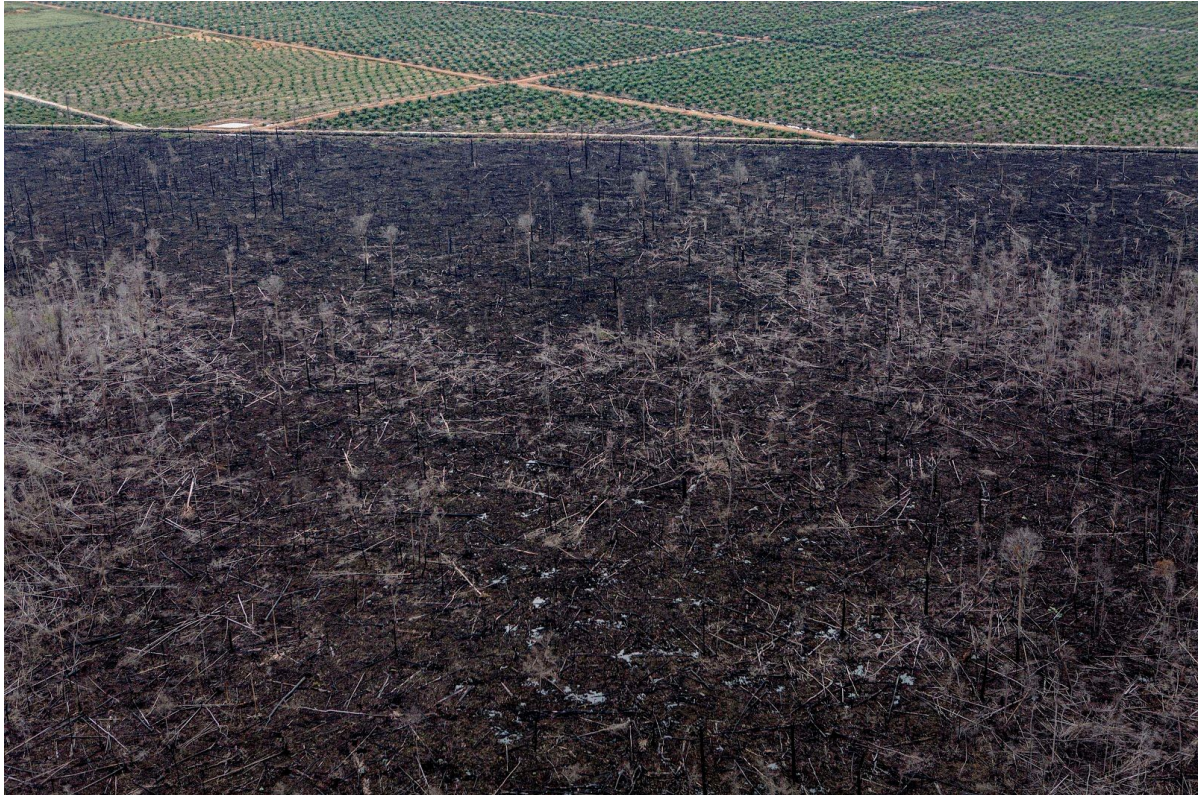
3 December 2015, PT Arrtu Energi Resources, 1°43'53.999" S 110°14'33" E": Burnt remains of forest following recent fires inside an oil palm concession owned by Rajawali/Eagle High in West Kalimantan. Visible in the background is an oil palm plantation operated by a different company, seemingly not impacted by the fires. All of the consumer companies and traders reviewed for this report are supplied by Rajawali/Eagle High.