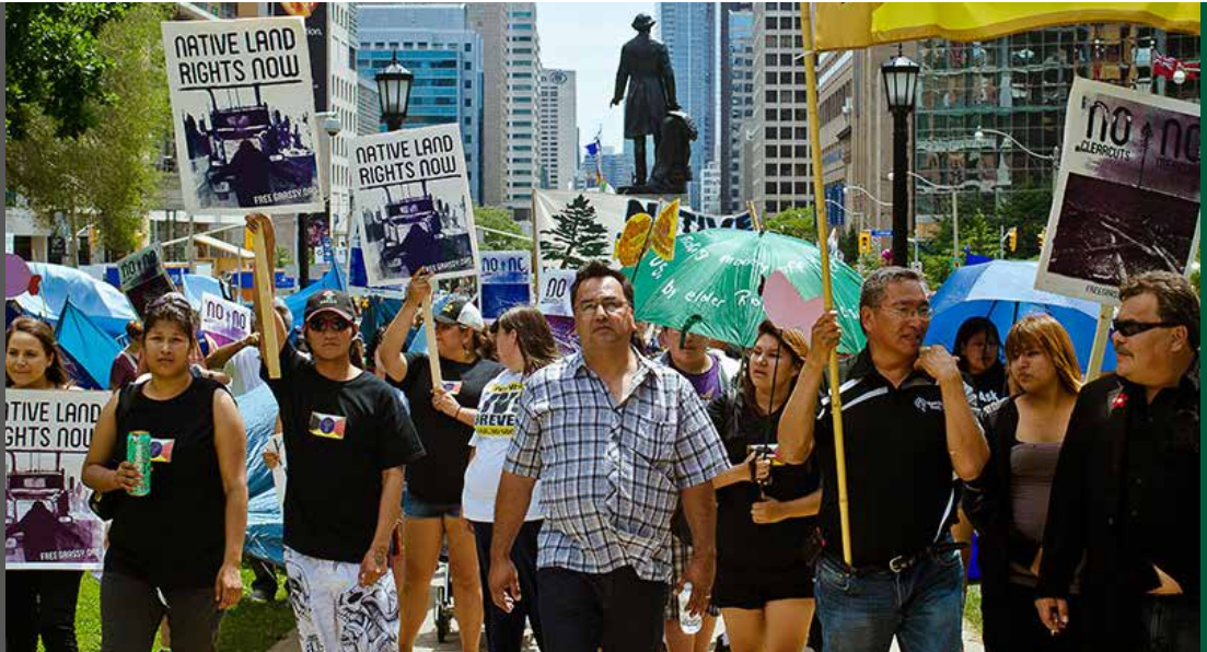
image: Grassy Narrows First Nation and supporters rally in Toronto against logging without consent on their traditional territories. June 2012

Resolute has clearly ignored two main low-risk indicators related to the CW social category wood, including: (i) a recognised dispute resolution process by affected parties to resolve conflicts of substantial magnitude pertaining to traditional rights; and (ii) there is no evidence of violation of the ILO Convention 169 on Indigenous and Tribal Peoples taking place in the forest areas in the district concerned.