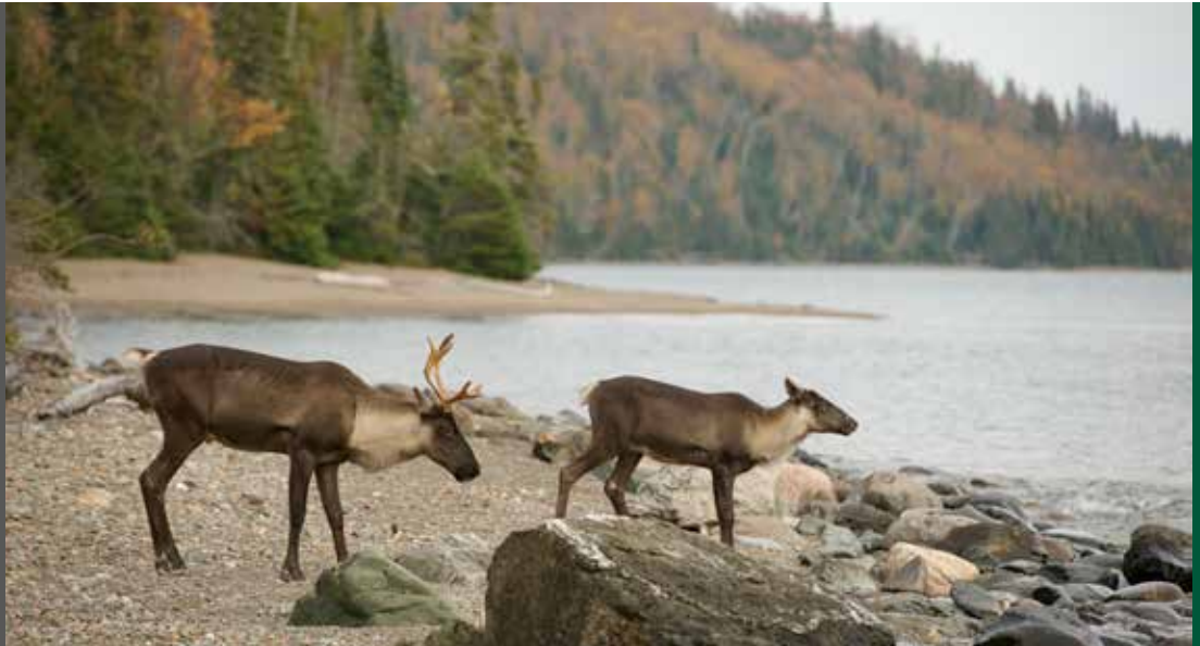
image: The threatened woodland caribou is being pushed to extinction because of destructive logging practices and other industrial developments.

In Ontario, where the Thunder Bay mill complex is located, there are insufficient protected areas in place to prevent the decline of the majority of woodland caribou herds. In fact, Ontario does not contain a single protected area that is large enough to ensure long-term caribou survival. 9 The Government of Ontario's own Woodland Caribou Science Panel found the province's approach to conserving caribou populations was "bound to result in failure to recover caribou populations," including its failure to adequately protect habitat areas. 10