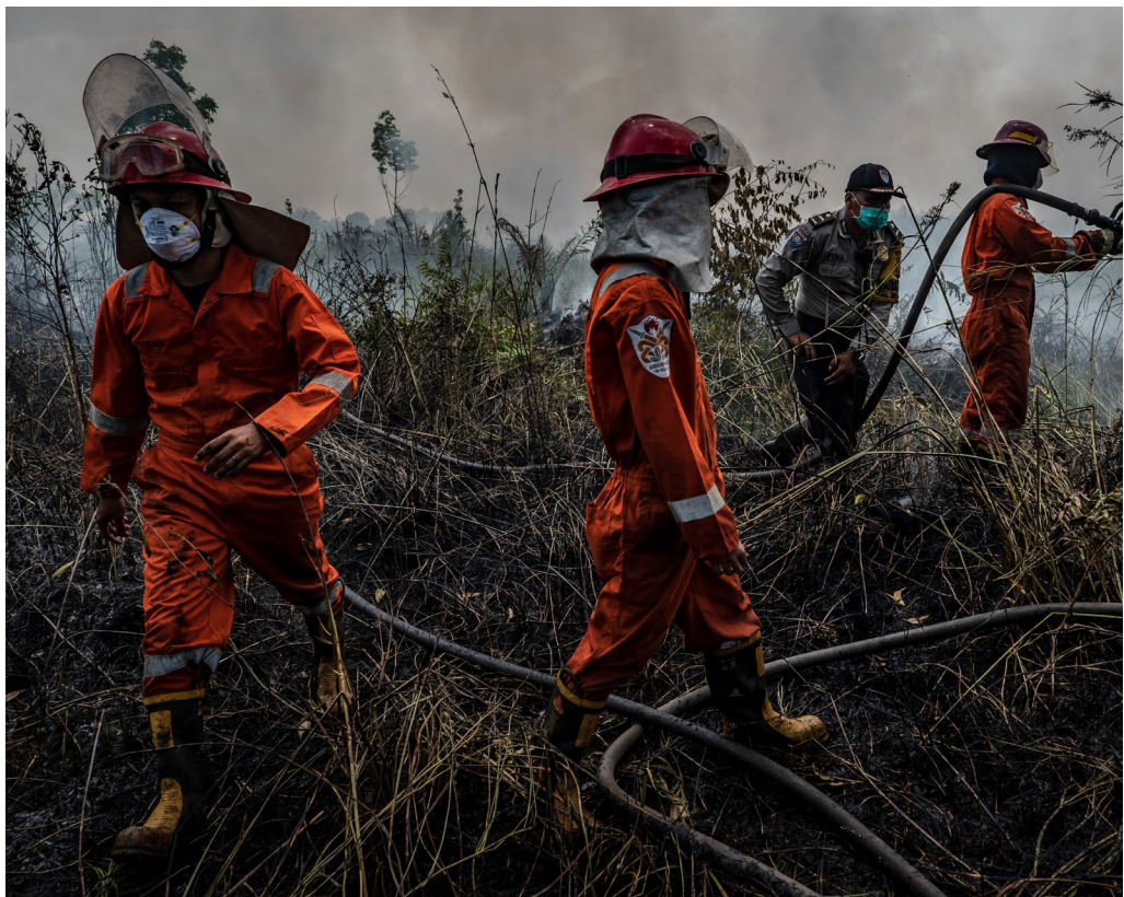
Forest Fires in Central Kalimantan