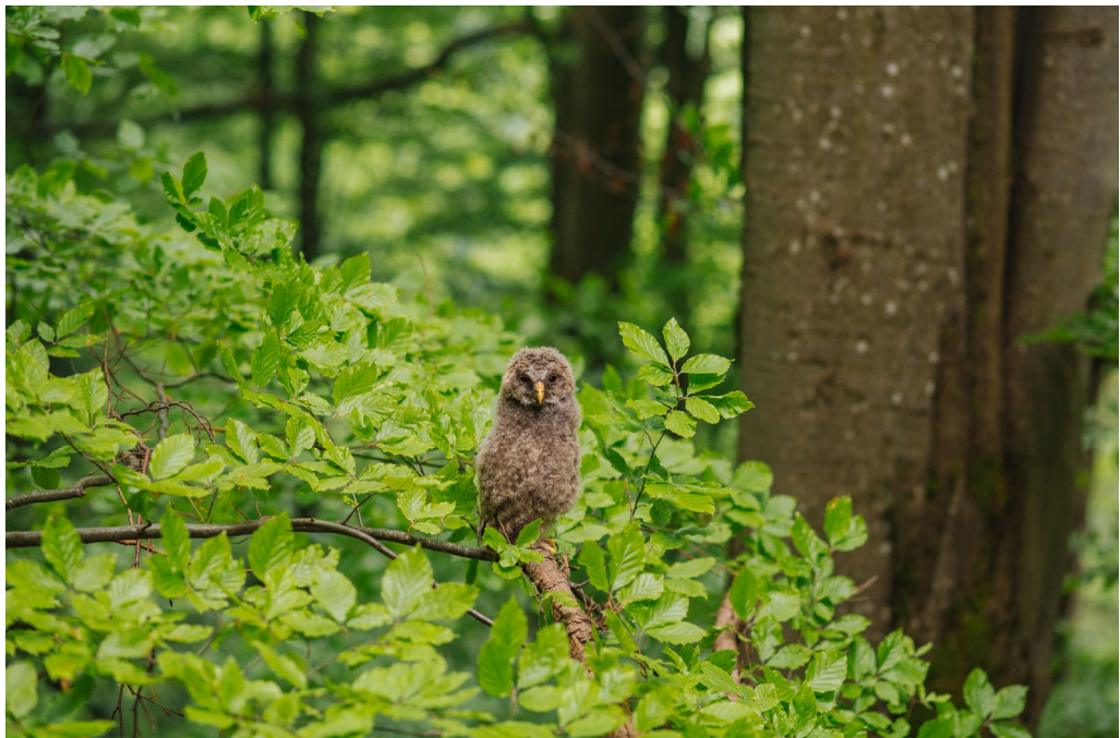
Owl in the Carpathian Forest in Ukraine