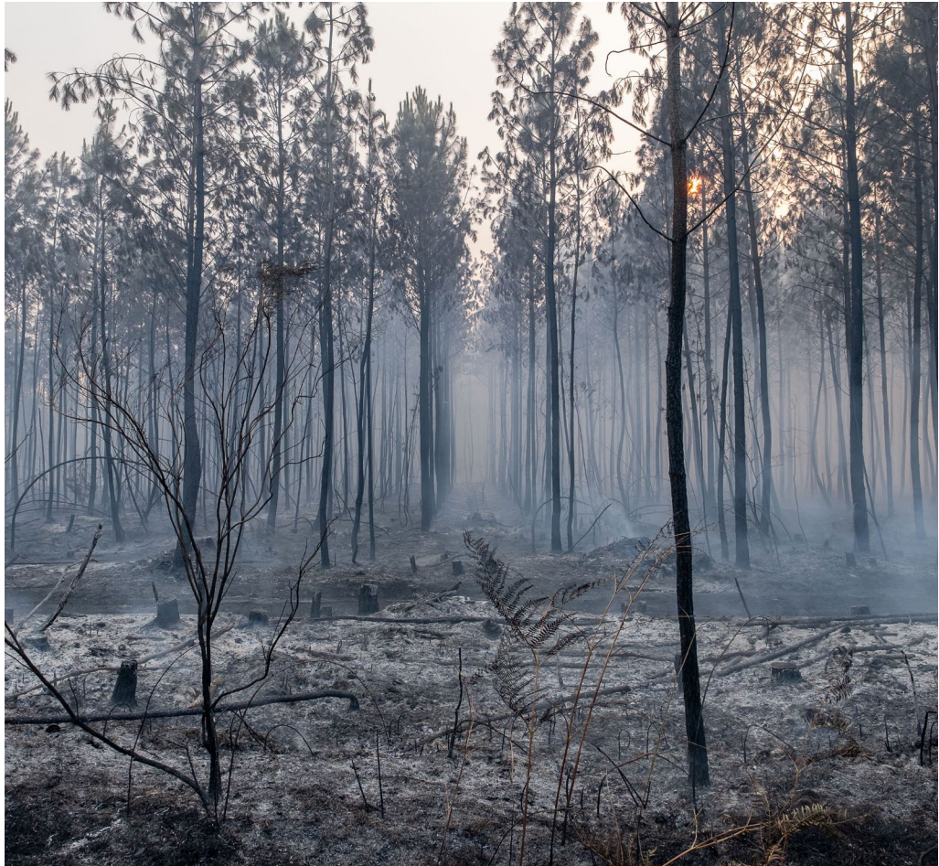
Climate Emergency in France: Forest Fires in Gironde