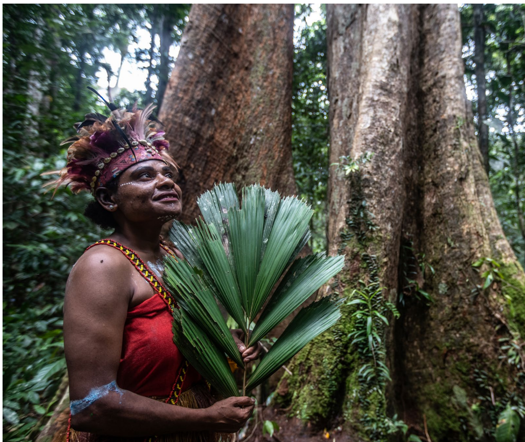
The 2nd Forest Defender Camp 2025 in Papua Day 4

Although there is broad support for almost all measures to protect against deforestation, backing is highest in countries which have historically been more impacted, like Indonesia, Kenya and Malaysia. Support for most measures is lower in the USA and South Korea compared to other countries, but still a large majority of respondents are backing them, while 78% of participants in the Global South believe that global agreements can significantly help protect against deforestation.