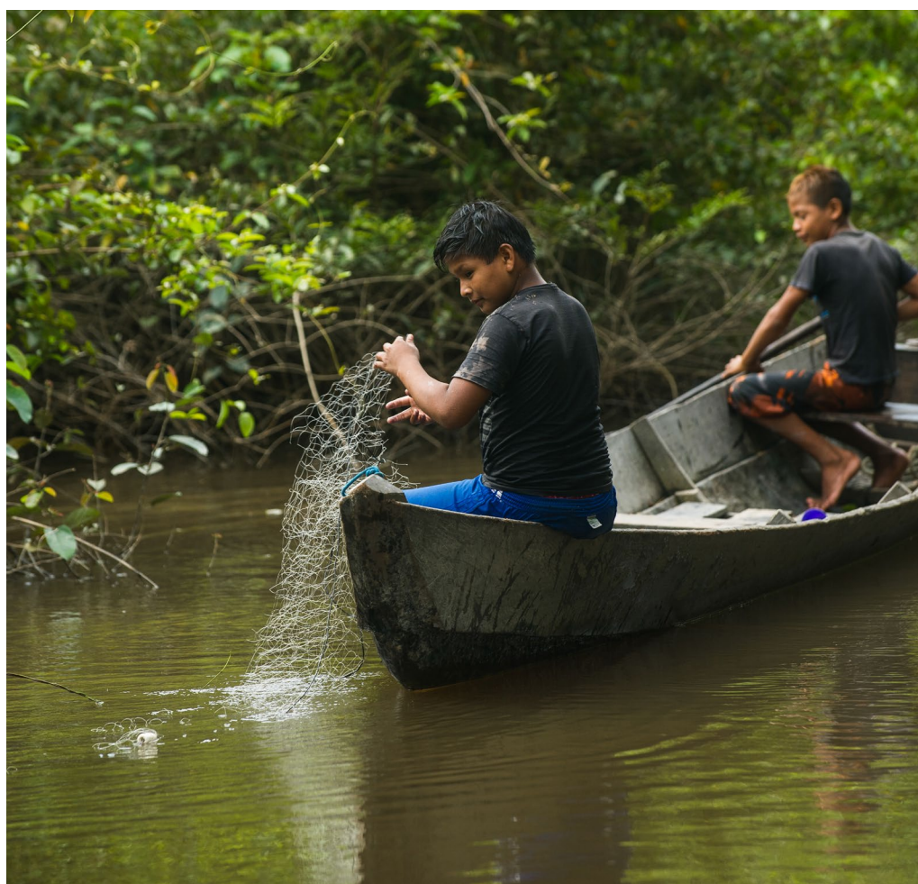
Munduruku Children Fishing in the Amazon Rainforest