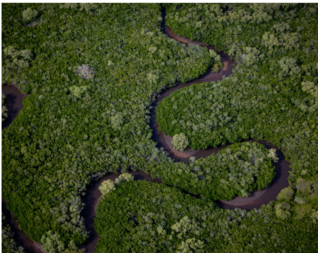
Forest in Abbot Point