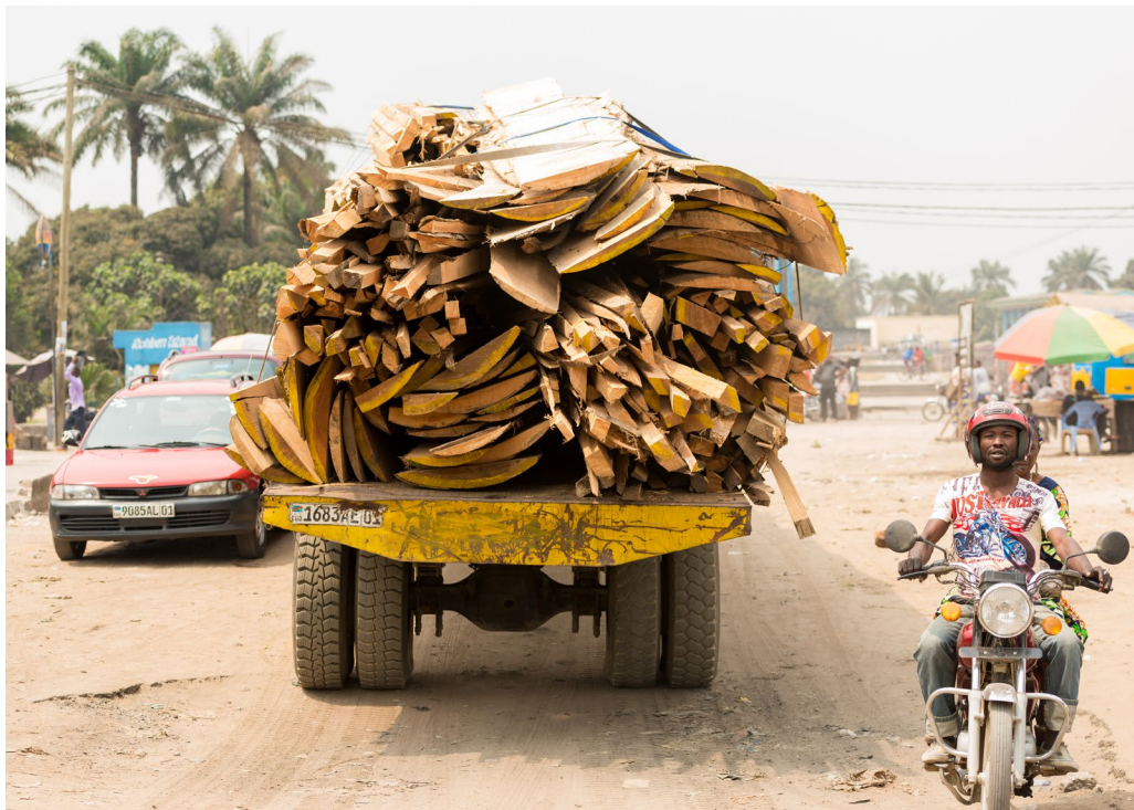
Transportation of Illegal Timber in the DRC