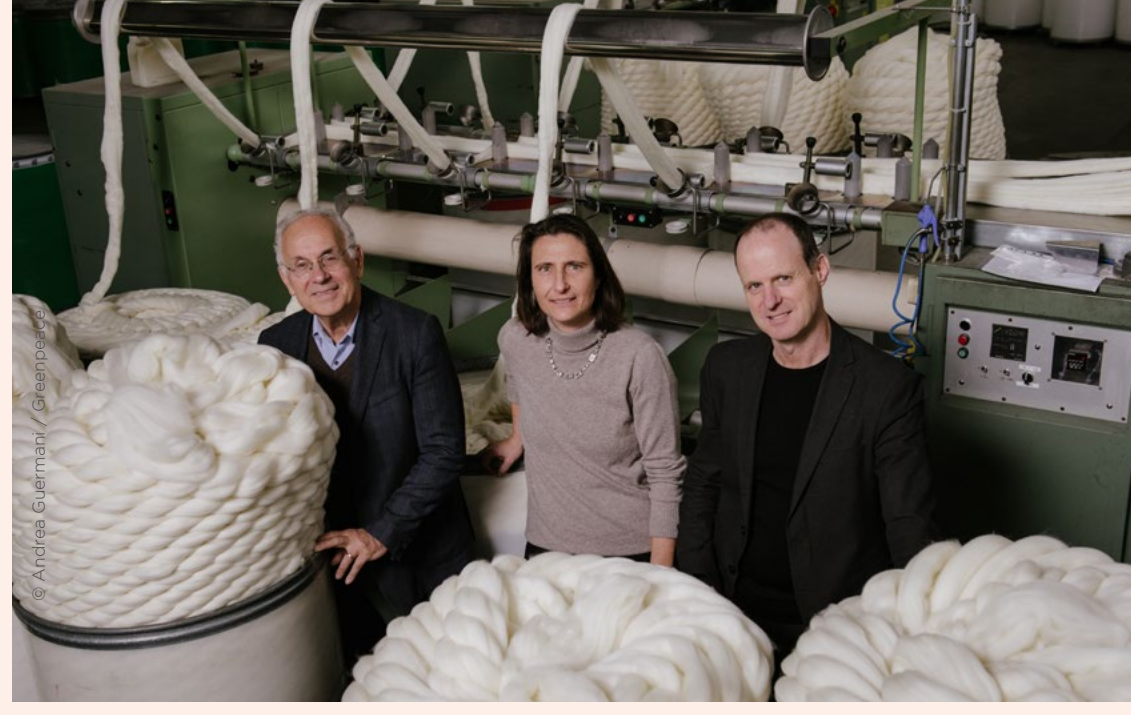
Manufacturing using Detox principles in Italy's textile district of Prato, where wool and cashmere is regenerated using a traceable system

More challenging, though promising opportunities are provided by changes in business models that not only focus on limiting and reducing damage but are part of a transformation in how clothes are produced, sold, shared, repaired and reused. These facilitate dematerialisation and the traceability of materials, waste and collected clothes; challenge ownership patterns; redefine sourcing and marketing strategies; and involve customers in a new narrative where there is also space for creative and cultural diversity. Although these examples of alternative business models are dominated by smaller or medium sized companies, there are signs that some larger companies are seriously evaluating these options for the longer term. Greater experimentation is therefore required by the big players in order to benefit from the opportunities that lie ahead.