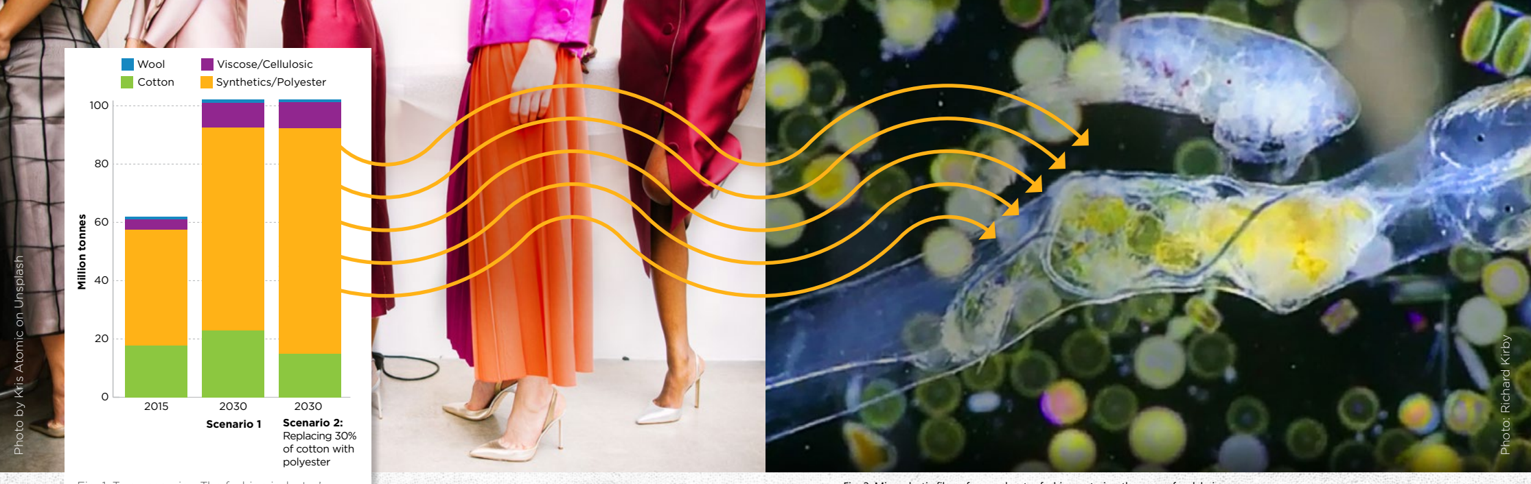
Fig. 1: Two scenarios: The fashion industry's projected increase in use of fibres by 20304