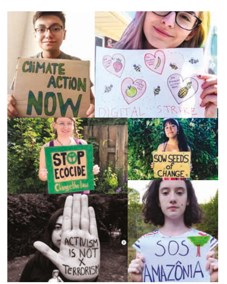
The youth continues it's fight for a better planet online, moving Fridays for Future online with the hastag #digitalstrike.

Along with other organisations and activists around the world, Greenpeace continues to firmly stand for justice and environmental protection in the midst of the pandemic. In increasingly creative and innovative ways, we continue to turn the global crisis into a great opportunity.