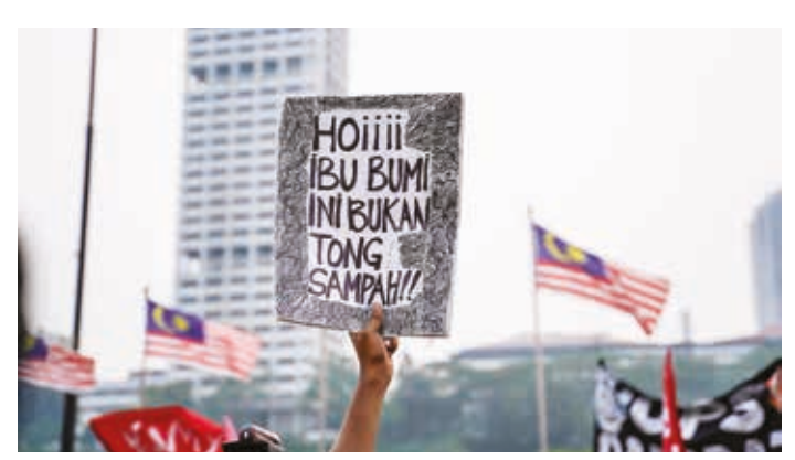
A climate striker opposite Dataran Merdeka holding up a hilarious but poignant sign saying 'Hoi, Mother Earth is not a rubbish bin' during the Global September Climate Strikes on 21 Sept, 2019, in which Greenpeace Malaysia took part in to support local climate youth activists in the heart of Kuala Lumpur.

What we eat is important to reconsider. Ask yourself about your meat consumption and try to reduce it, so you can contribute to the fight against climate emergency. 14.5% of global greenhouse gas emissions come directly from livestock. Also, you can take this time to battle plastic pollution. Start by checking how many single-use plastics you consume currently and if they're necessary. They're not! Find a way to reuse the plastic you already have.