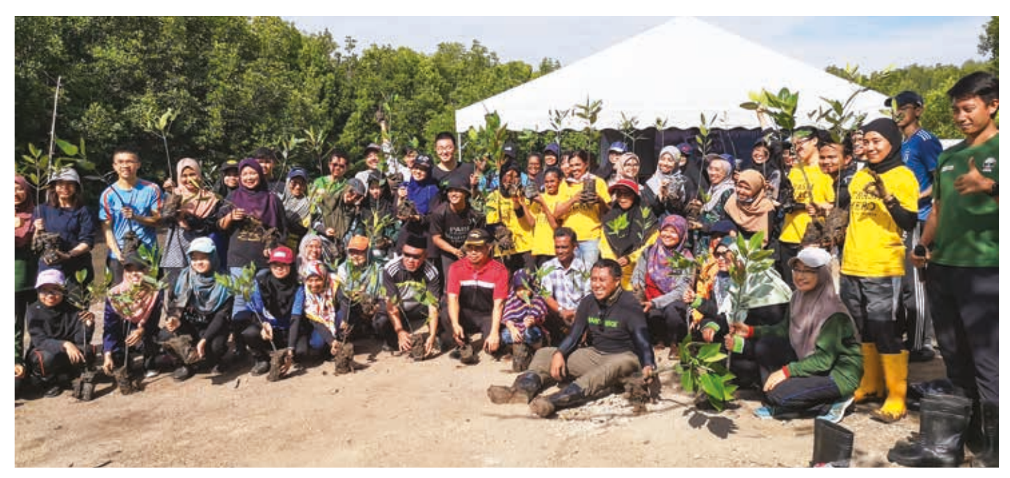
Learning about the miraculous traits of mangrove forests is one thing, but having the chance to contribute to its preservation and growth is something special. Greenpeace volunteers along with KUASA set out to help plant saplings to repopulate the coastal area of Manjung, Perak.

Apart from the Mangrove site, conservation was a big part of the environmentally educational trip to Perak. So then we visited the nearby Pusat Konservasi Dan Penerangan Penyu Segari in Teluk Senangin. Learning about how we can better preserve our natural environment and the habitats of animals living in them. And turtles are definitely among those little creatures we hope to protect, releasing baby sea turtles back into their natural habitat after they've hatched safely.