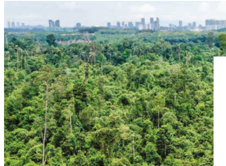
DEGAZETTEMENT OF KUALA LANGAT