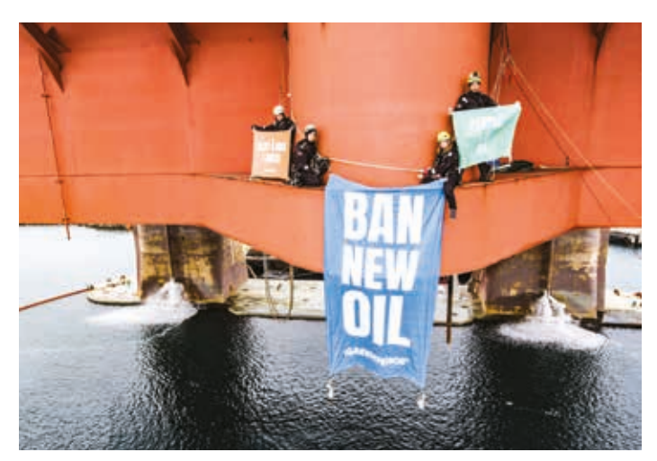
Greenpeace activists from Norway, Sweden, Denmark and Germany climb Equinor's oil rig the north of Norway with a banner that reads "Ban New Oil."