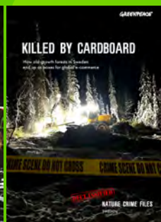
Nature Crime Files Sweden Killed by Cardboard