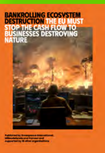
Bankrolling Ecosystem Destruction: The EU Must Stop the Cash Flow to Business Destroying Nature