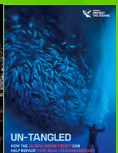
Un-Tangled: How the Global Ocean Treaty Can Help Repair High Seas Mismanagement