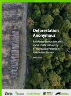
Deforestation Anonymous: Rainforest destruction and social conflict driven by PT Mayawana Persada in Indonesian Borneo