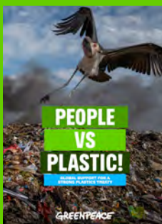
People vs Plastic! Global Support for a Strong Plastics Treaty