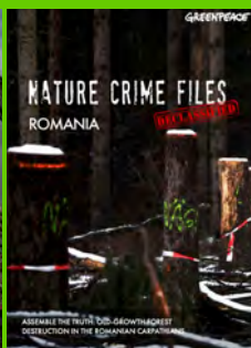
Nature Crime Files Romania Assemble the Truth