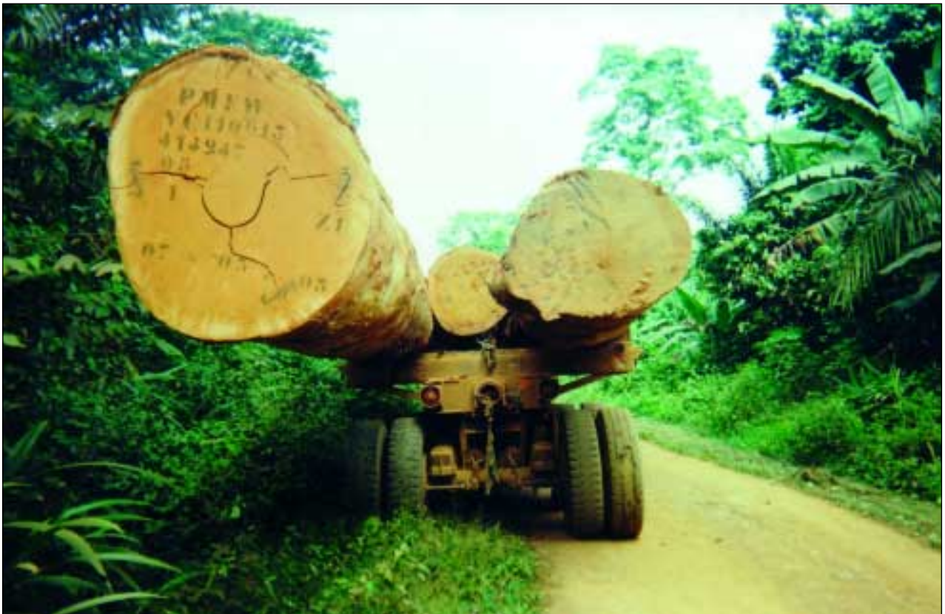
Reef logs on their way to the sawmill.