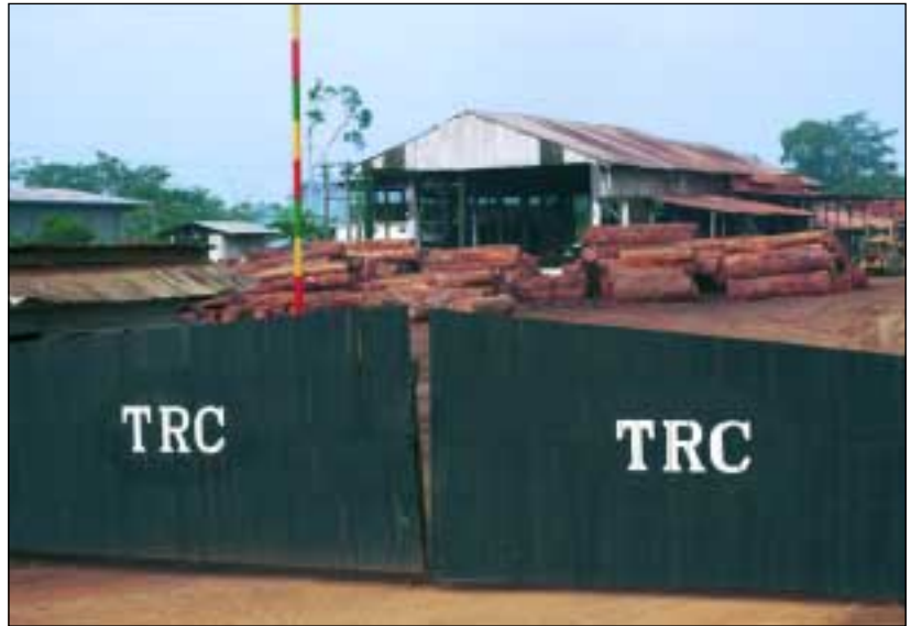
Reef's sawmill in Kumba.