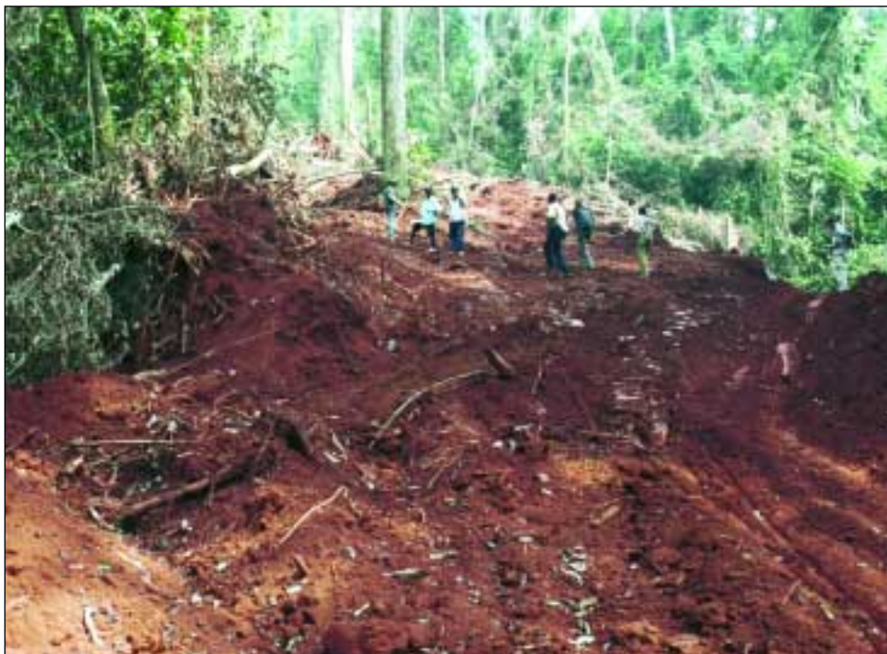
Logging road in Reef's Vente de coupe 11-06-13.