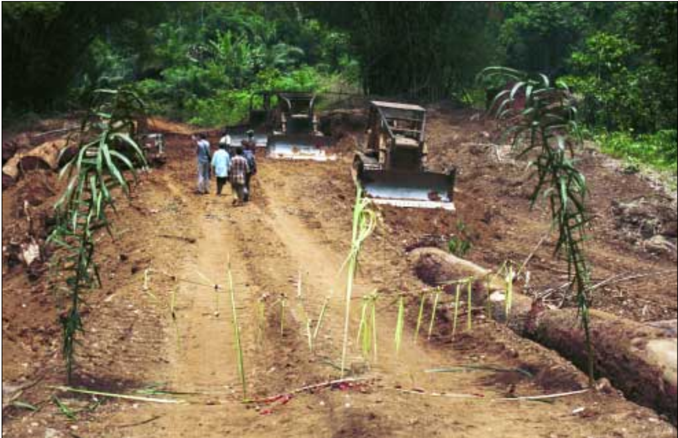
Traditional barrier set up by villagers of Molongo to stop Reef's logging operation.