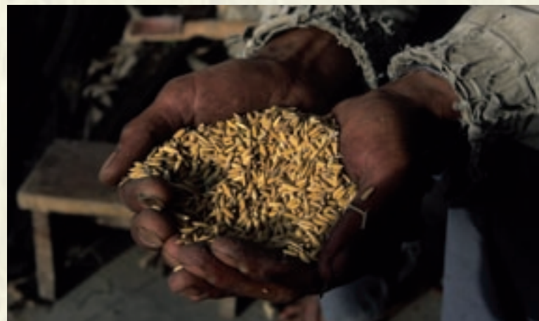
A Hani farmer holding traditional rice seed, Yunnan Province, China.

The other cases of illegal releases involved black market or misleading sales (the Philippines and Brazil) and the illegal distribution of GM fish to pet shops (Japan).