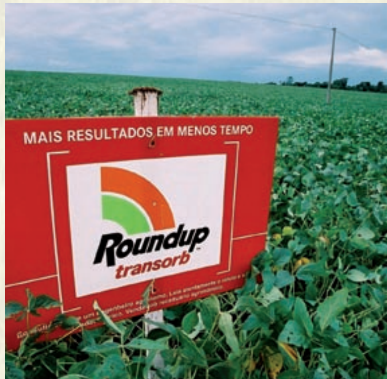
Soya field with Roundup transorb label, a herbicide produced by the US company Monsanto, Rio Grande do Sul, Brazil.

It is not known when APHIS will publish the findings of its investigation.