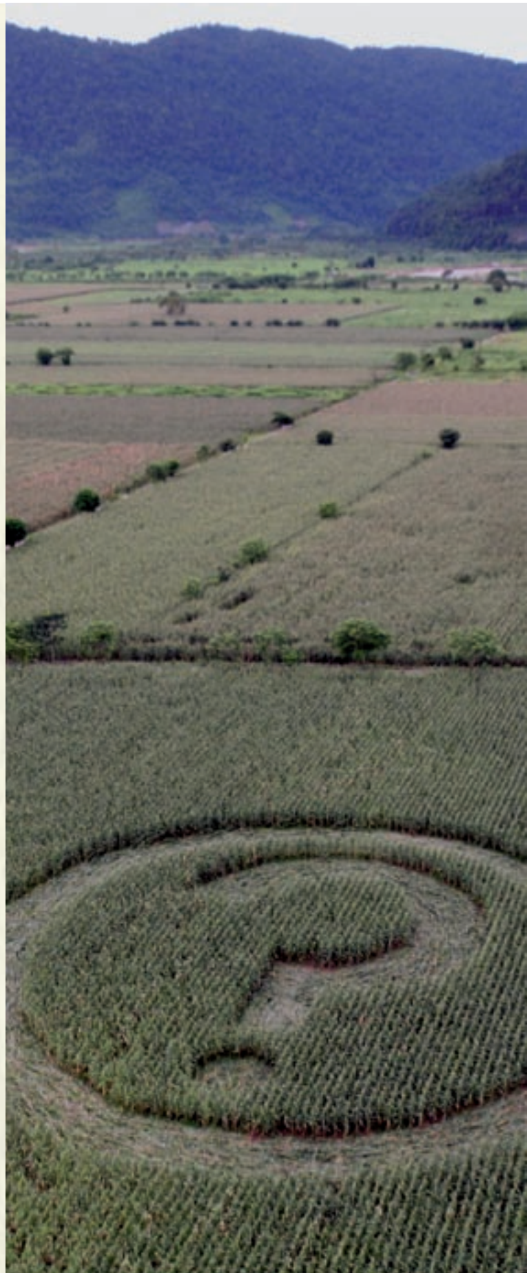
Greenpeace create a 65m "crop circle" question mark in a maize field in Ayotzintepec, Oaxaca, a region that has been contaminated by genetically engineered maize. The question mark signifies the unknown nature of where genetic contamination can occur. August 2006

A paper published in Nature in 2001 reported GM contamination in native landraces of maize even though no GM maize should have been grown there commercially. It seems that farmers may have kept and sown maize imported for food. In 2003, contamination was found in maize grown in the states of Chihuahua, Morelos, Durango, Mexico State, Puebla, Oaxaca, San Luis Potosí, Tlaxcala and Veracruz.