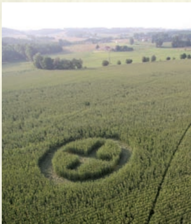
Greenpeace activists entered a GE (genetically engineered) maize field in Southern France and carved a giant "crop circle" with an "X" in the GE maize, marking the field as a contamination zone.