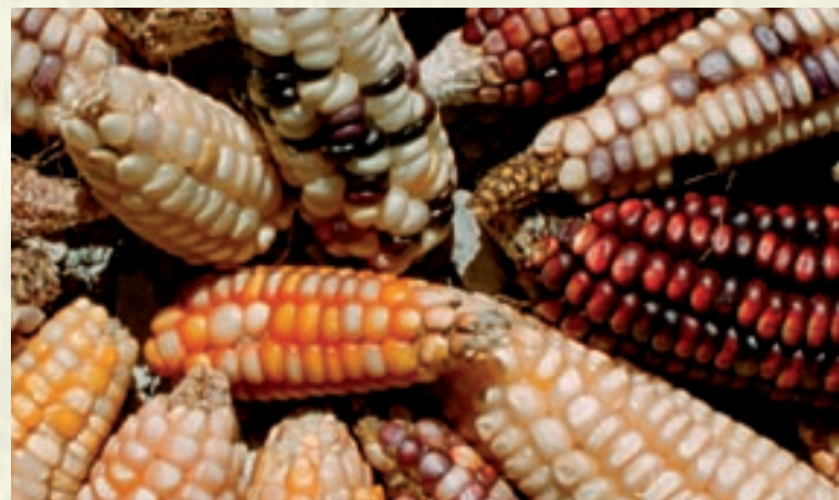
Varieties of Mexican maize. Oaxaca, Mexico

One of the most concerning aspects of the growing number of global contamination incidents is the continuing recurrence of contamination in maize seed stocks. Over the last ten years contaminated maize seed has been found in eleven countries: Austria, Chile, Croatia, France, Germany, Greece, Italy, New Zealand, Slovenia, Switzerland and the United States of America. All five contamination events in New Zealand over the last seven years have been incidents of maize seed contamination. In 2006, maize seed contamination was documented in four countries: France, Germany, New Zealand and Slovenia. The last contamination event recorded in 2006 was contaminated maize seed found in New Zealand.