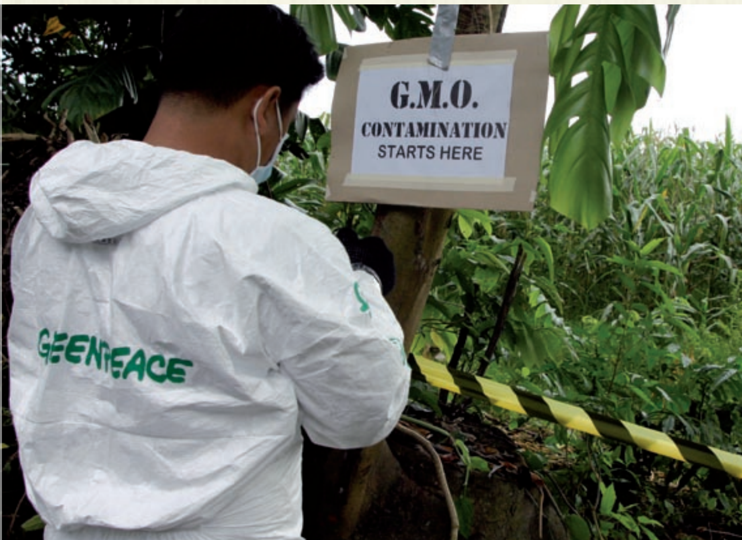
Greenpeace volunteers cordon off a plantation of BT corn as a 'hot zone', as farmers, agriculture and government officials uproot the plantation of genetically engineered BT Corn and demand for a GMO free Mindoro.

Published by Greenpeace International Ottho Heldringstraat 5 1066 AZ Amsterdam The Netherlands t +31 20 718 2000 f +31 20 514 8151