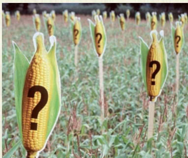
Greenpeace marks a maize field with signs showing corn with a 'question mark' indicating that 1 in 200 maize crops can be genetically contaminated if the draft EU seed directive is passed.