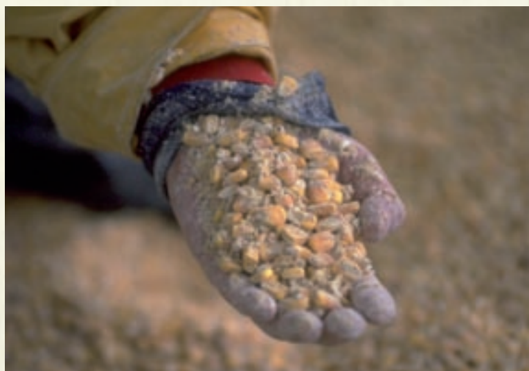
Genetically engineered maize.

This report gives information about the additions to the register in 2006 and highlights important cases and trends. Short details of all of the incidents are included in Annex 1.