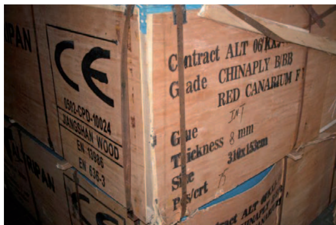
Red Canarium plywood found at Altripan coming from Jiangshan Wood.