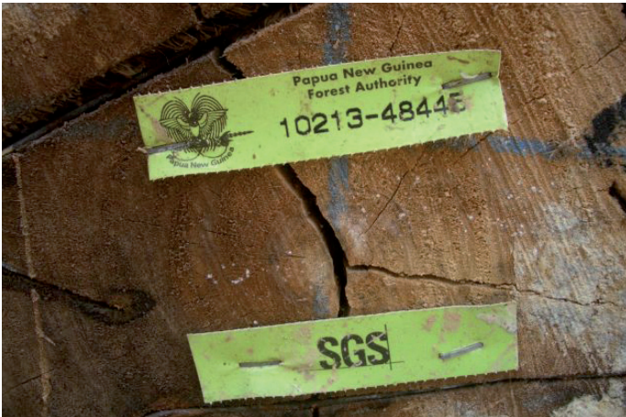
Red Canarium logs veneer mill storage yard with code 10213, indicating that the logs are from Rimbunan Hijau's Turama concession.

The Arser Group supplies Belgian trader, Altripan, which in turn sells to Hoek Lopik. 14