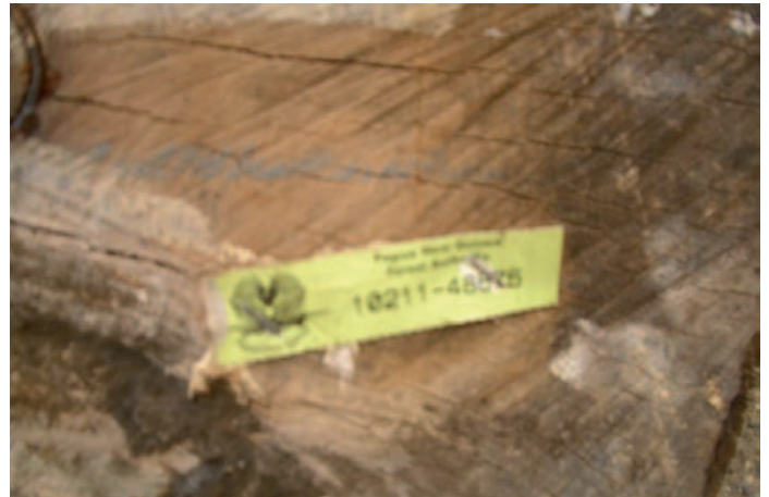
Red Canarium logs veneer mill storage yard with code 10211, indicating that the logs are from Rimbunan Hijau's Turama concession.