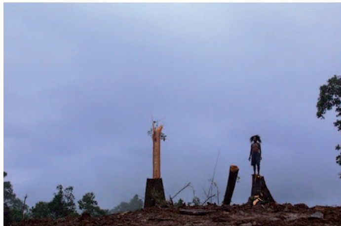
Pepsy Diabe, from the Kamala clan, Kosuo tribe, stands amidst the devastation of a recently logged mountainside.