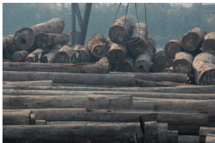
Wood markets of China.

Plywood with a core made up of Chinese grown poplar but faced with tropical, ancient forest species, such as Okoume from Africa or Bintangor and Red Canarium from Papua New Guinea and the Solomons is a particularly good selling commodity in Europe. In the booming heartland of eastern China there are thousands of small, family-run veneer mills running their machines throughout the day,