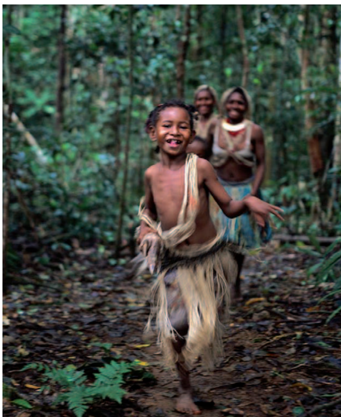
Children Playing in the forest, Papua New Guinea.

Almost 90% of the saw/veneer grade logs from PNG were exported to China.