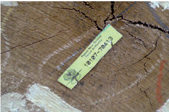
Photo taken at the log yard of the veneer mill supplying the Arser Group's plywood suppliers. The log export number 10107 belongs to Wawoi Guavi, subsidiary of Rimbunan Hijau.