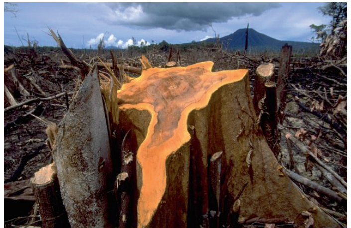
Papua New Guinea forest destroyed by logging.

In order to highlight the inadequacies of the Dutch law to address the import of illegal timber, Greenpeace turned itself into the