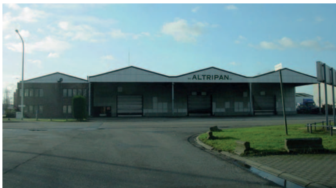
Belgian Trader, Altripan.

The Red Canarium plywood found at Oldenboom is supplied by Altripan. One of Altripan suppliers is the Arser Group, which trades in plywood made from PNG timber, including from Rimbunan Hijau.