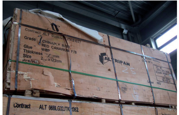
Red Canarium plywood found at BouwCenter, with the Altripan and Arser Group logos.

The Red Canarium plywood found at both Hoek Lopik and the BouwCenter is stamped with the EU Construction Products Directive (CPD) certificate number (0502-CPD-10028) and supposedly processed by Huaian Arser Wood. However, communication with the certifier SKH, confirmed that the code "10028" is only valid for full poplar plywood. Furthermore, the Arser Group confirmed to Greenpeace researchers that Huaian Arser Wood does not produce tropical faced plywood. This suggests that the Arser Group may be fraudulently using Huaian Arser's admission to the EU market under the Construction Products Directive for products of uncertified mills.