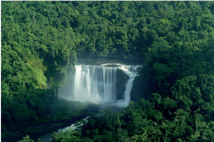
Waterfall, Kamula Dosa, Lake Murray, Papua New Guinea.

The last letter from the Ministry of Housing, Spatial Planning and the Environment (VROM) was characteristic of the low ambitions of the previous Government: 4