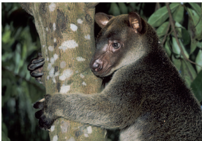
Tree Kangaroo. The habitat of many species is under threat from destructive and illegal logging in the rainforest of Papua New Guinea.

Papua New Guinea is a nation located on the world's largest tropical island. Its magnificent forest forms part of the few remaining significant ancient forests on earth. It is home to wildlife such as the tree kangaroo, the world's largest pigeon, the largest butterfly on earth – the Queen Alexandra's birdwing, with a wing span of over 11 inches – and the world's longest lizard, along with over 3000 species of orchid.