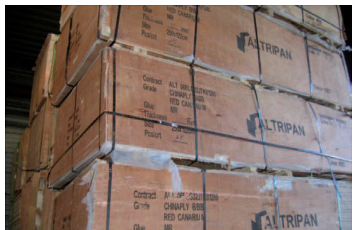
Red Canarium plywood found at Emmerik Nijmegen, member of the Oldenboomgroup, with the Altripan logo.