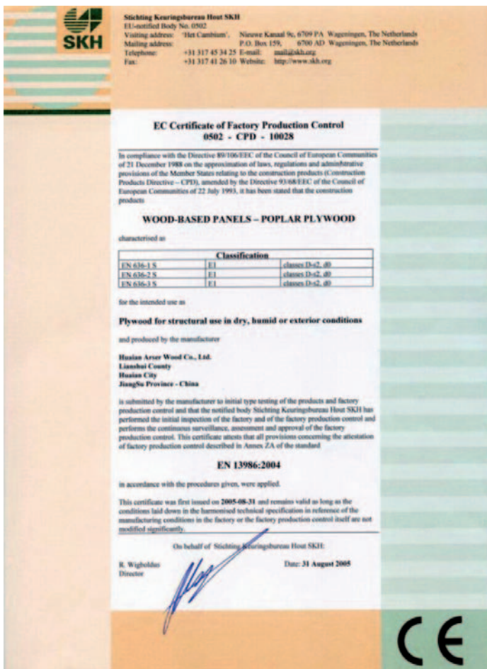
Huaian Arser, EU-CPD Certificate