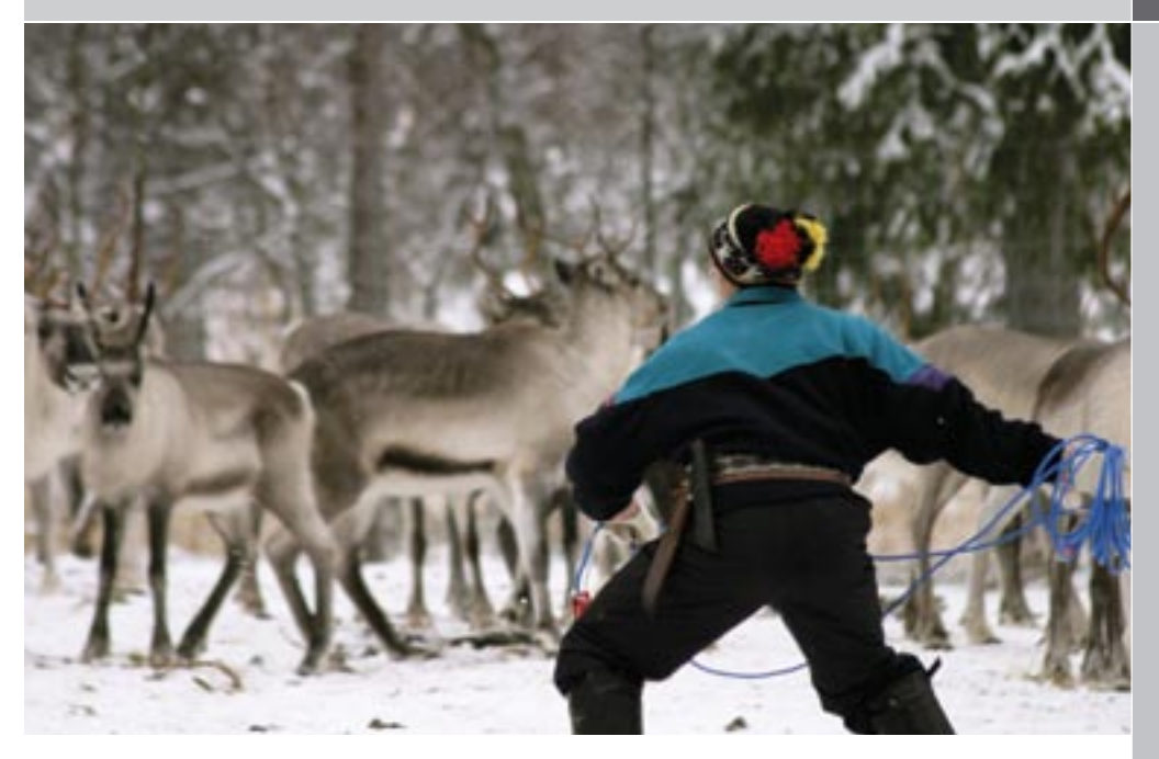
Reindeer herding is central to the Sami culture. Unless old-growth forests, critical to traditional reindeer herding are protected from logging, scenes such as these could become a thing of the past.

How the Finnish government is abusing the forest rights of Sámi reindeer herders