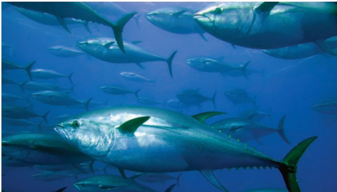
School of Tuna

In addition, retailers should demand that the companies they purchase tuna from have sustainable and equitable policies and are actively engaged in advocating sustainable management of tuna stocks at the political level.