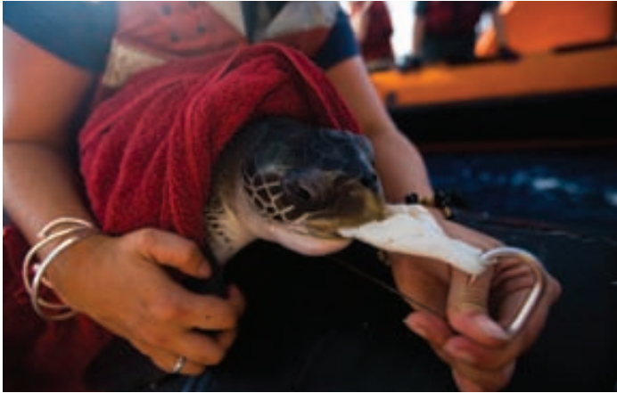
Many species of turtle are accidentally hooked and killed on tuna longlines each year in the Pacific.