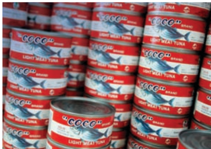
Above: Canned Skipjack tuna for sale in a supermarket

If retailers want to continue selling tuna in the future, then they need to take action now. This means an end to buying from unsustainable, unfair and, in many cases, illegal sources. To be able to ensure that the tuna bought is sustainably caught from well managed fisheries, retailers must be able to trace the chain of custody of the tuna they buy. This means knowing, where, when and how it was caught, and also that the fishing operator pays a fair price for their fishing license from the coastal states whose resources they exploit.