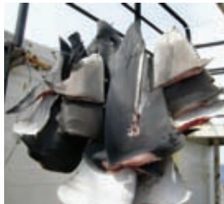
Shark fins hanging to dry on the longliner Win Full 6 in international waters in the Central Pacific.