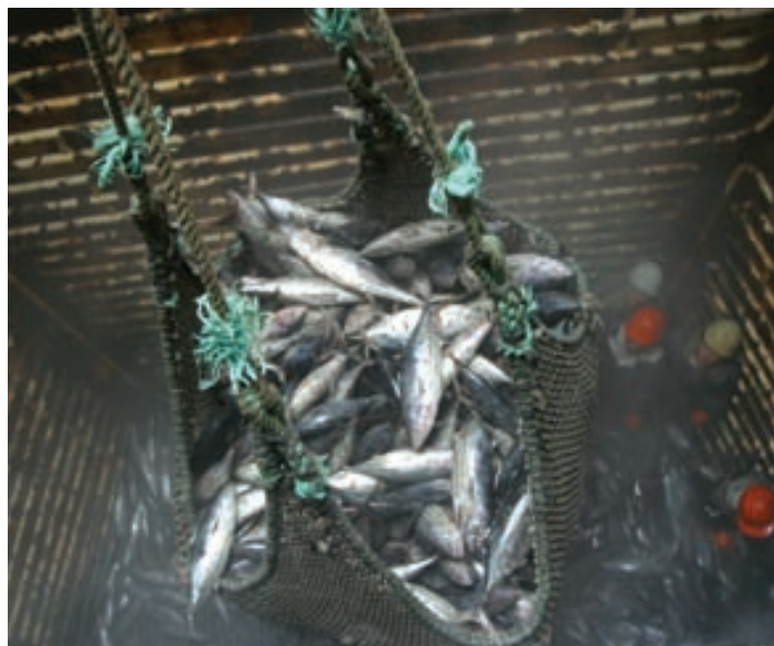
Chinese workers from Shandong province work in the hold of fishing vessel unloading tuna in Pohnpei Island, Federated States of Micronesia.

Only by knowing the chain of custody of tuna right back to the boat that caught it, can retailers ensure the product they sell comes from legal sources. The first step is to check that none of the vessels and companies traded with are on the Greenpeace blacklisted vessels database at: http://blacklist.greenpeace.org Tuna should be rejected if it comes from operations that have transferred tuna at sea and/or cannot guarantee 100% observer coverage on their vessels. Observers ensure compliance to conservation and management measures.