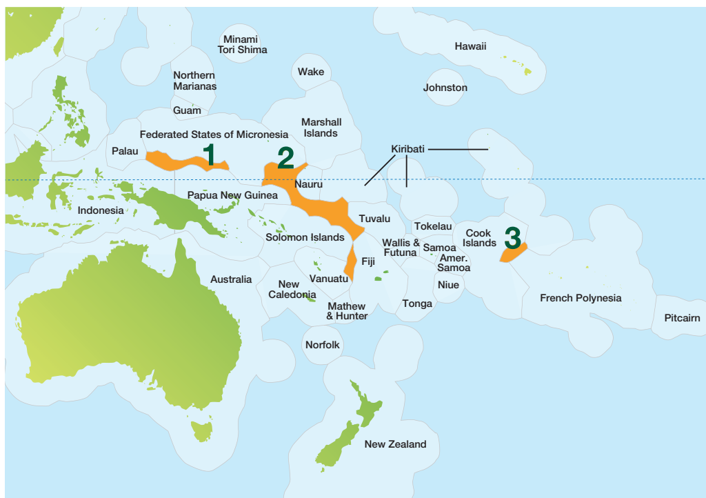
Map 1: Greenpeace is calling for the highlighted areas to be closed to all fishing activities and designated as marine reserves.

Retailers are also urged to support the historical move by eight Pacific Island Countries 14 in May 2008 to close the international waters of the Pacific that lie between the Pacific Island Countries (see map 1, areas 1 & 2) to all tuna fishing from 2010 onwards. In an attempt to restore the troubled tuna stocks of the Pacific and to protect the broader marine environment the Western and Central Pacific Fisheries Commission also agreed to close these areas to purse seining at its 5th Session from 2010 onwards. Retailers should ensure that they support the aspirations of the Pacific island countries and do not purchase any tuna caught inside these areas.