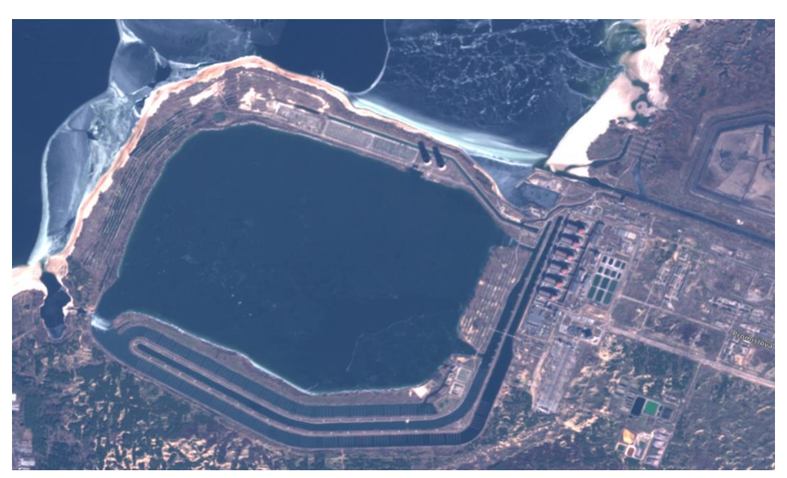
Sentinel satellite image of Zaporizhzhia nuclear plant, showing cooling pond and sandbanks exposed by more than 2 meter drop in water level of Kakhovka reservoir – Sentinel.