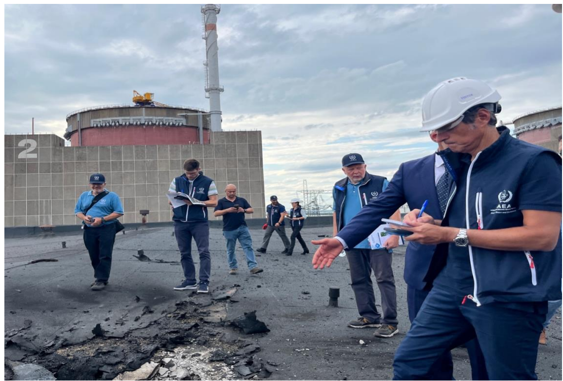
IAEA inspection of Zaporizhzia nuclear plant, 1 September 2022