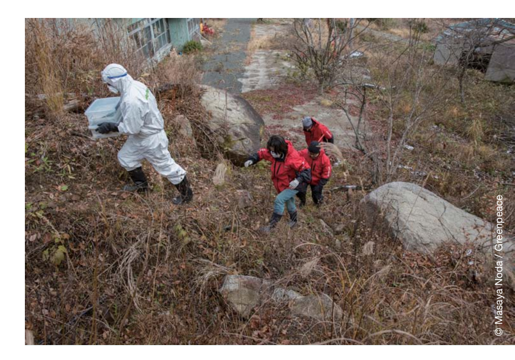
Greenpeace radiation survey, litate, Fukushima Prefecture, November 2016.

wooden house, which reduces the inside radiation to 40% of the outside radiation. Whereas the average measured level outside the house was 0.7\mu Sv/h which would equal 2.5mSv/yr, based on government shielding estimates, the dose badges inside the house showed values in the range between 5.1 to 10.4mSv/yr. The Japanese government's long-term decontamination target is 0.23 \mu Sv/h which would give a dose of 1mSv/yr.