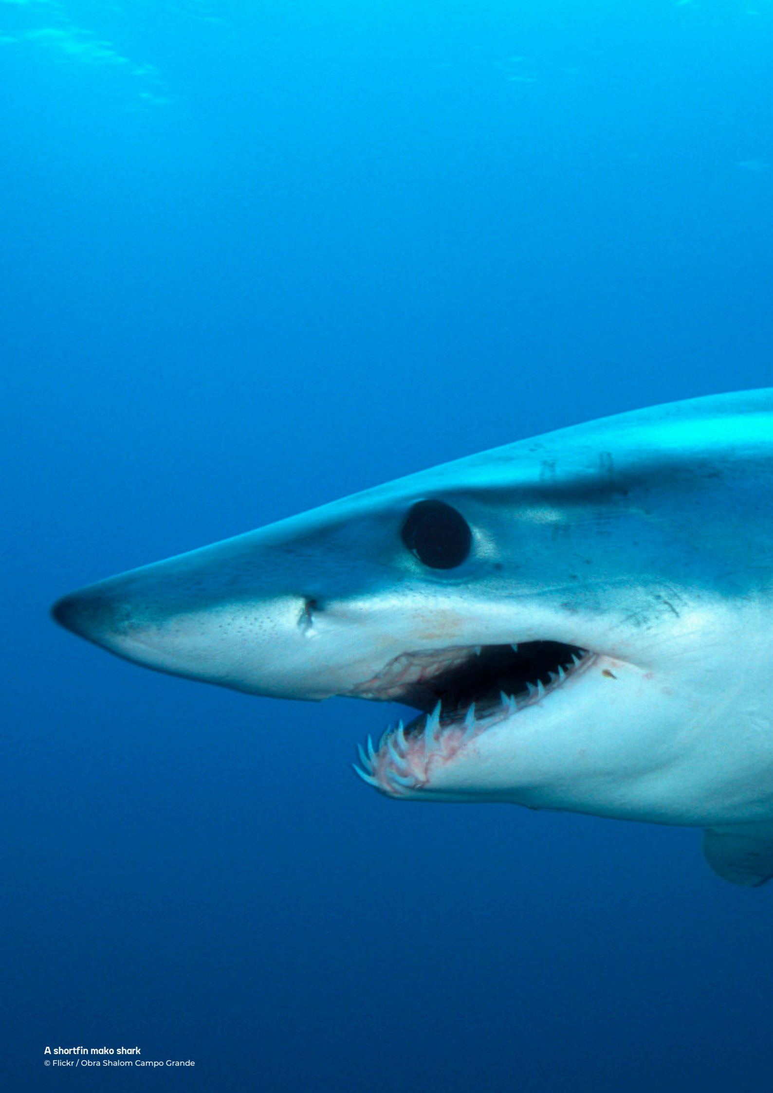
A shortfin mako shark