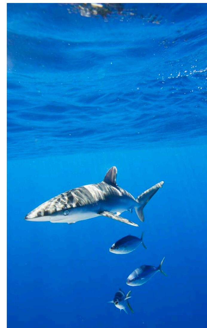
Shark in the Pacific Ocean

The case in the ICCAT Convention Area is unfortunately representative of what happens under the purview of practically every single RFMO. Complex and ecologically important species like blue shark require coordinated efforts to protect breeding grounds and migration routes across vast areas. A Global Ocean Treaty could ensure that such an oversight in governance would be filled for important species like these that are currently falling through the gaps, including through the designation of fully protected marine protected areas. In one study of nearly 90 marine protected areas with varying degrees of protection, fourteen times more sharks were found inside effectively protected areas than in unprotected areas. 26 Sharks play a vital role in oceanic ecosystems, and have been part of them for an estimated 450 million years. Whilst they display a great diversity of species, the large predator role they play is especially important in maintaining healthy marine life communities. In instances where large sharks have been fished out, often unexpected trophic changes have taken place – leading to further imbalanced ecosystems with lesser predators unchecked. Examples of this include the increase in cow-nosed rays in seas off