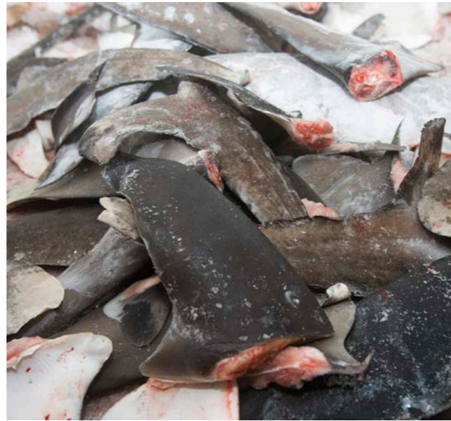
Shark fins onboard a Taiwanese vessel in the Pacific Ocean