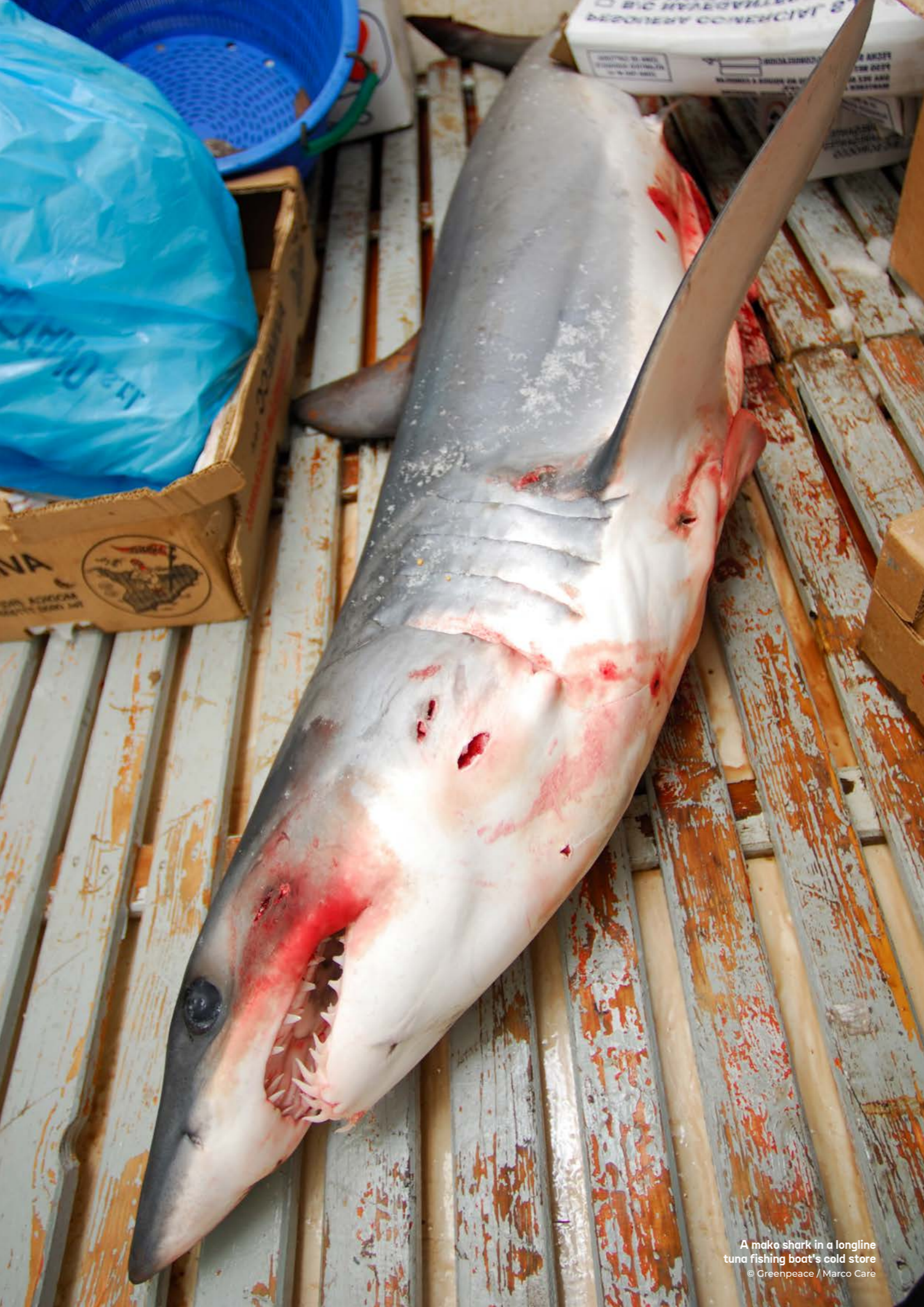
A mako shark in a longline tuna fishing boat's cold store