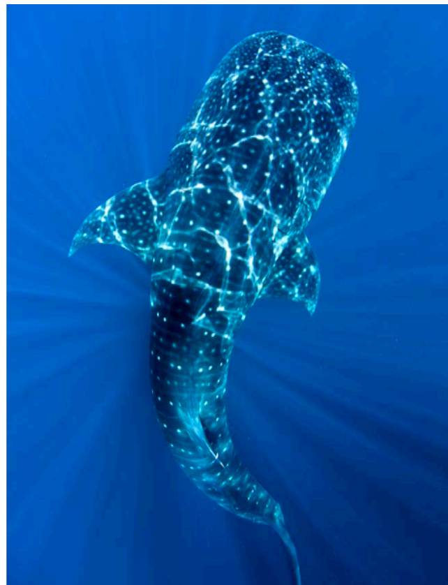
Whale shark