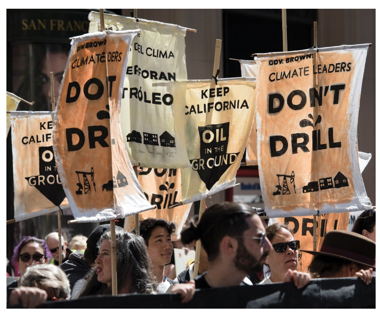
Rise for Climate, Jobs & Justice March in San Francisco

As climate disasters and planned blackouts roil the state, the need for urgent climate action could not be clearer.