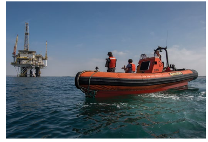
Offshore Oil FLIR Detection in California

Governor Newsom has taken some encouraging policy steps and has signaled that the oil and gas industry will play a declining role in California's economy. If Governor Newsom can follow up these moves with an ambitious and visionary plan to phase out oil and gas production in the state, he would affirm California's status as climate policy leaders, setting the pace for the U.S. and the world. What's clear is that Californians from frontline communities and around the state will be watching his next moves with interest, and demanding solutions that leave no one behind.