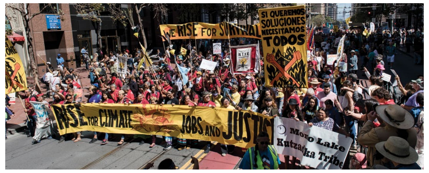
Rise for Climate, Jobs & Justice March in San Francisco