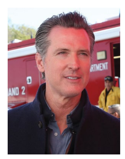
California's Governor Gavin Newsom

In January 2019, California's Governor Gavin Newsom was inaugurated as the leader of the world's fifth largest economy at a time of great peril and opportunity for our climate. In the next decade, we must cut emissions in half to be on track to limit warming to 1.5°C and avoid the most disastrous consequences of climate change.1