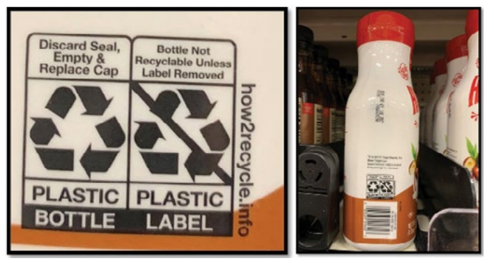
Figure 8: Expanded Image of Full Body Shrink Sleeve Label on HDPE #2 Bottle

This labeling practice is not compliant with the FTC Green Guides and is deceptive in two ways: