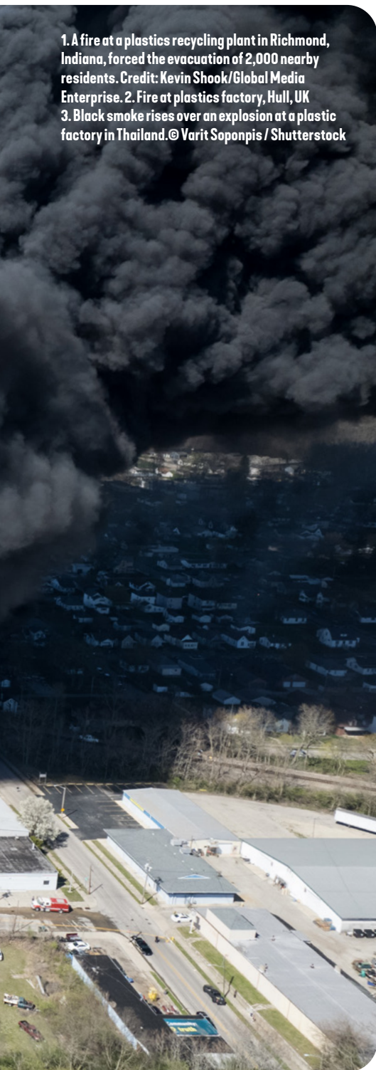
1. A fire at a plastics recycling plant in Richmond, Indiana, forced the evacuation of 2,000 nearby residents. 2. Fire at plastics factory, Hull, UK 3. Black smoke rises over an explosion at a plastic factory in Thailand.

plastic recycling facility fire in 2020, health experts warned residents to avoid or thoroughly wash local produce due to the toxicity of chemicals released by burning plastics. 35 In the 12 months up to April 2023, large fires have been reported at plastic recycling facilities in Australia, 36 Canada, 37 Ghana, 38 Russia, 39 Southern Taiwan, 40 Thailand, 41 and the United Kingdom, 42 and in the U.S. states of Florida, 43 Indiana, 44 North Carolina, 45 and Nebraska 46 (at a plant that was producing plastic lumber from recycled plastics).]