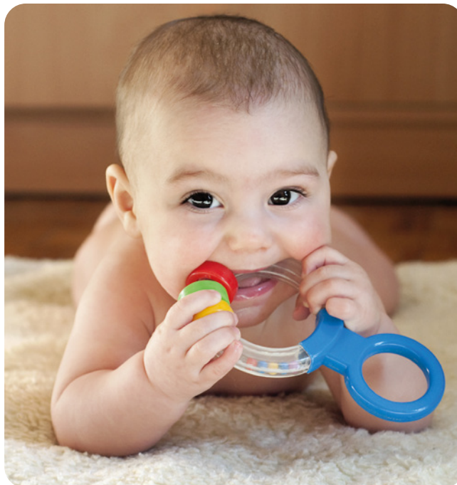
Babies chew plastic toys.

Without dramatically reducing plastic production, it will be impossible to end plastic pollution and eliminate the health threats from chemicals in plastics.