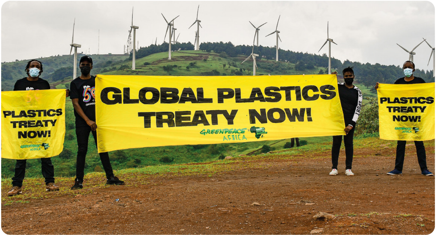
Activists from Greenpeace Africa hold banners in support of a Global Plastics Treaty. Ngong Hills, Nairobi, Kenya, 02/24/2022