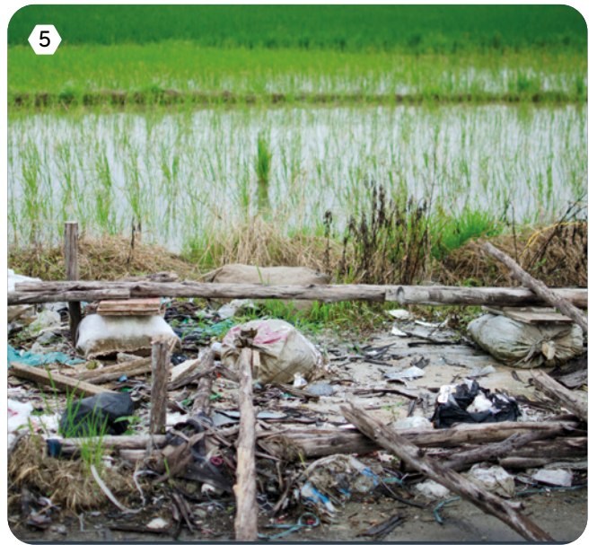
1. Plastic wrapped apples in a Hong Kong supermarket 2. Municipal collection of recycling 3. Plastic in a landfill in China 4. Fish that ingested microplastic 5. Garbage next to rice fields in China 6. Microplastics pollution from the river Rhine in Germany 7. Cooking with eggs