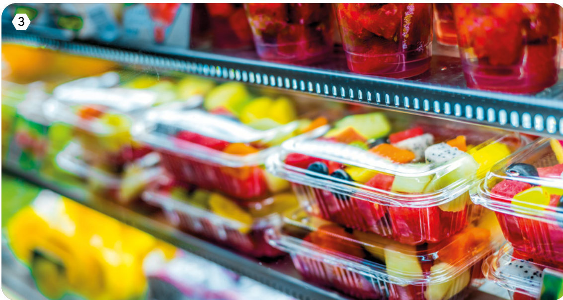
1. Plastic fragments 2. Electronic waste recycling plant in Turkey 3. Fruit in single use plastic packaging 4. Product images of plastic bottles made by Coca-Cola, Pepsi and Nestle, three of the biggest plastic polluters. 5. Child chewing on plastic toy