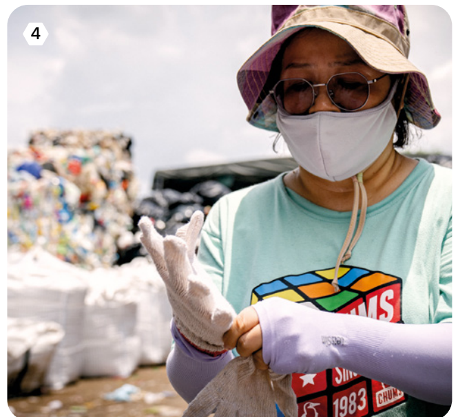
1. Recycled plastic in India 2. A trash collector working in a waste collection facility in Istanbul, Turkey. 3. Electronic waste recycling plant in Turkey 4. Volunteer wearing gloves to handle plastic sorting work at a plastic recycling plant.