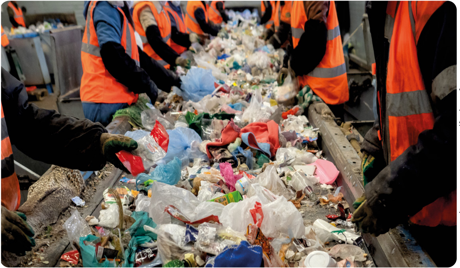
Wastesorting at a recycling plant, Sterlitamak, Russia, 10 January 2019.

Without dramatically reducing plastic production, it will be impossible to end plastic pollution and eliminate the health threats from chemicals in plastics.