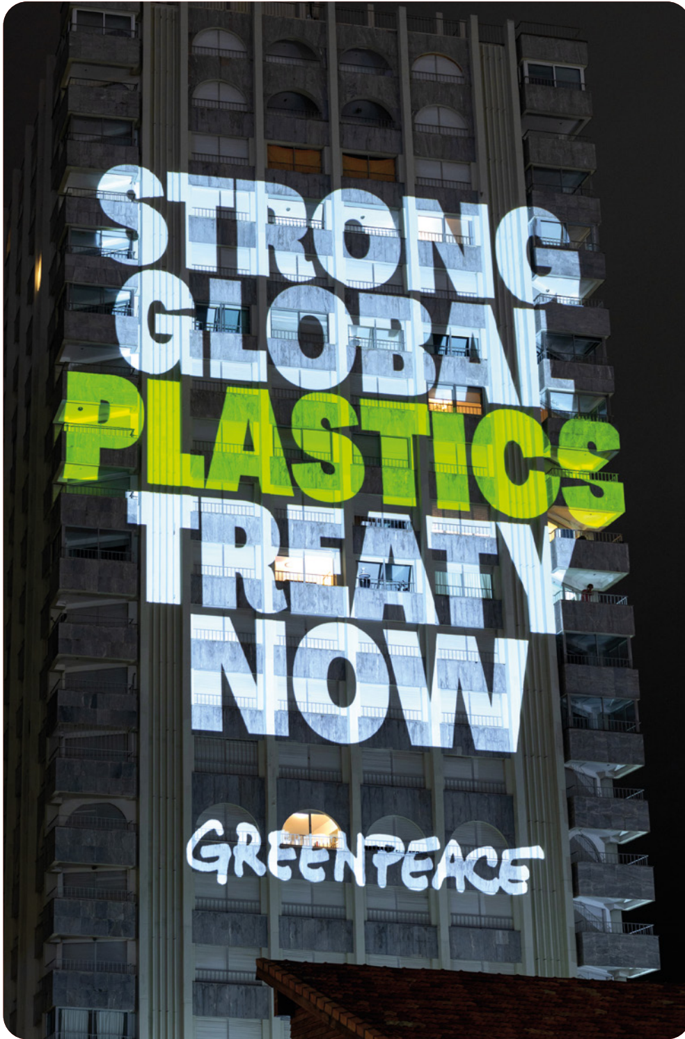
Greenpeace projects messages and plastic waste imagery in Uruguay as global leaders come together to discuss a Global Plastics Treaty in Punta del Este, Uruguay.