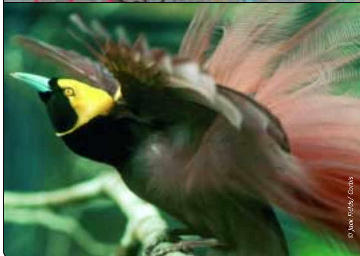
The bird of paradise, Papua New Guinea's national emblem, seen depicted on a log tag in Zhang Jia Gang port in China and in its natural habitat - ironically, forest product exports to China and elsewhere are destroying the bird's habitat and threatening Papua New Guinea's economic security and social stability