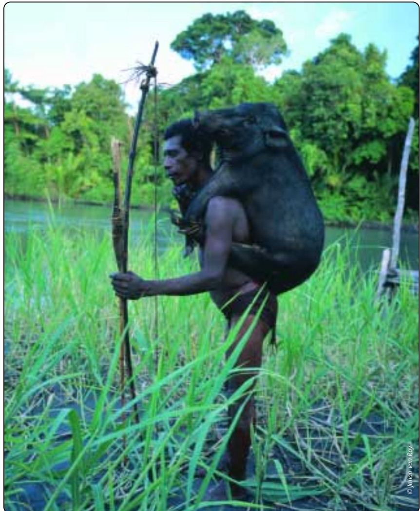
Hunter bringing home a wild pig - a main source of protein for many Papua New Guinea forest communities, and one which depends on healthy forests