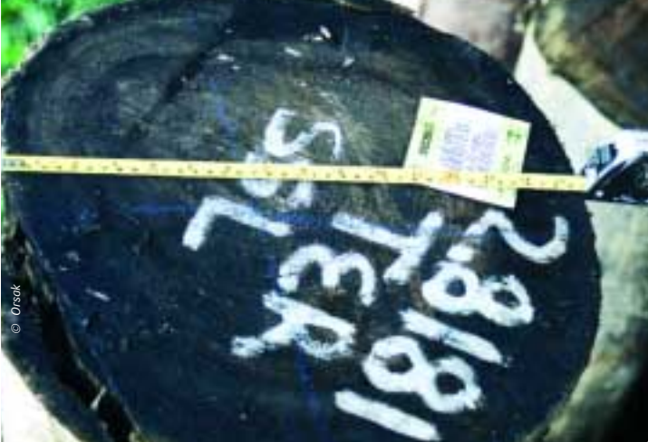
Papua New Guinea's Logging Code of Practice mandates that only trees above 50cm may be cut, but violations of this and other rules are commonplace in the country's forestry sector