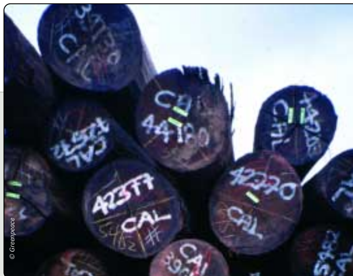
Logs of Calophyllum from Concord Pacific in China’s largest port, Zhang Jia Gang; Calophyllum is mainly used in the production of plywood and furniture, both of which are extensively exported to the US, Europe and Japan

At the same time, China has recently seen a rapid growth in its furniture sector, which is currently worth over US$12 billion a year. Dominated by foreign joint-venture companies, the export trade for this furniture is estimated to be worth more than a third of that total, with major markets in the US (55%), Hong Kong (15%), Japan (10%) and the EU (11.8%). 38 One of the main regions for furniture production within China is around Shanghai, where manufacturers are provided with easy access to the largest log port in China – Zhang Jia Gang. It is here that the majority of logs exported from Papua New Guinea to China are destined to go; it is also the main export destination for Concord Pacific’s Papua New Guinean logs. 39