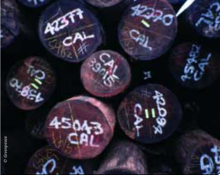
Logs from the Malaysian-owned company Concord Pacific exported from Papua New Guinea to China