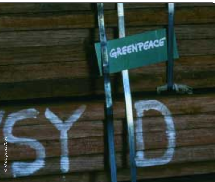
A shipment of community-produced eco-timber from a Greenpeace-supported project in the Solomon Islands - by specifying products certified by the Forest Stewardship Council, consumers can be part of the solution rather than the problem

Despite its problems, Papua New Guinea presents a unique opportunity to set a global example in effecting such a turnaround. More than 95% of its area is privately held under customary ancestral land tenure, which is upheld by the country's constitution, and cannot be alienated or sold. Moreover, half of the country's ancient forests still remain unallocated in large tracts. The country also boasts a greater diversity of intact, largely self-reliant subsistence cultures than anywhere on earth, a relatively independent judiciary, a free press and some extraordinary and visionary leaders. Given these circumstances there is a real chance to develop an alternative future for Papua New Guinea – and to achieve genuine community-centred forest conservation and sustainable forest use. The result would be the protection of more than 5% of the earth's terrestrial species, along with the spearheading of innovative and effective models for ecologically and socially responsible development.