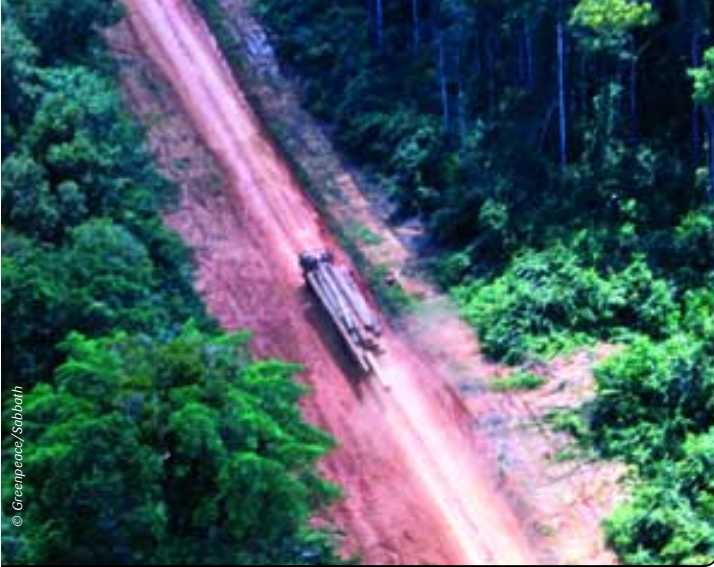
Logging truck bringing logs down the Kiunga-Aiambak road for export - it is likely this is the only use the 'road' will get