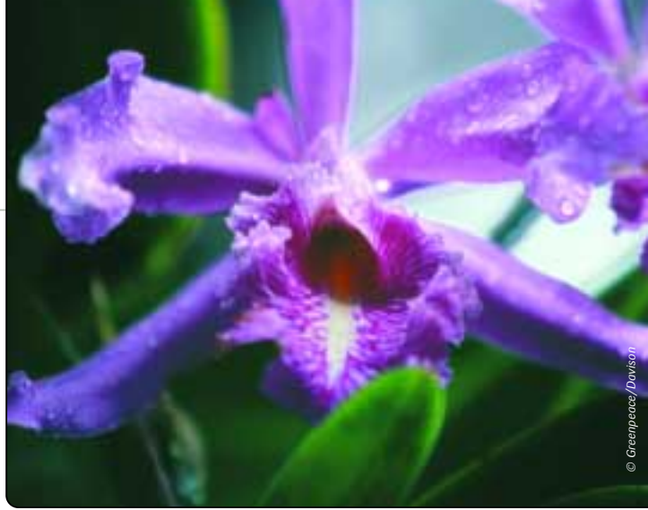
Papua New Guinea's forests have a plant diversity among the highest in the world, with over 15,000 species, including the greatest diversity of orchids on earth