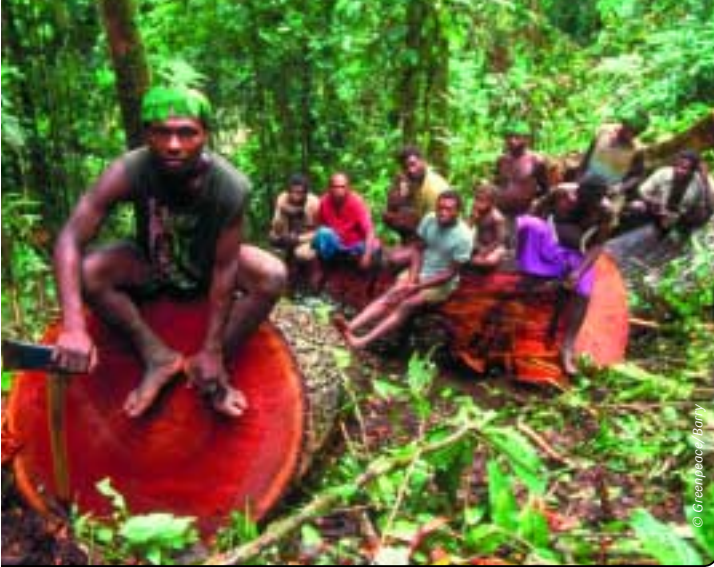
Community Eco-Forestry Team at the end of a long day, West New Britain, Papua New Guinea - eco-forestry is a growing enterprise in Papua New Guinea