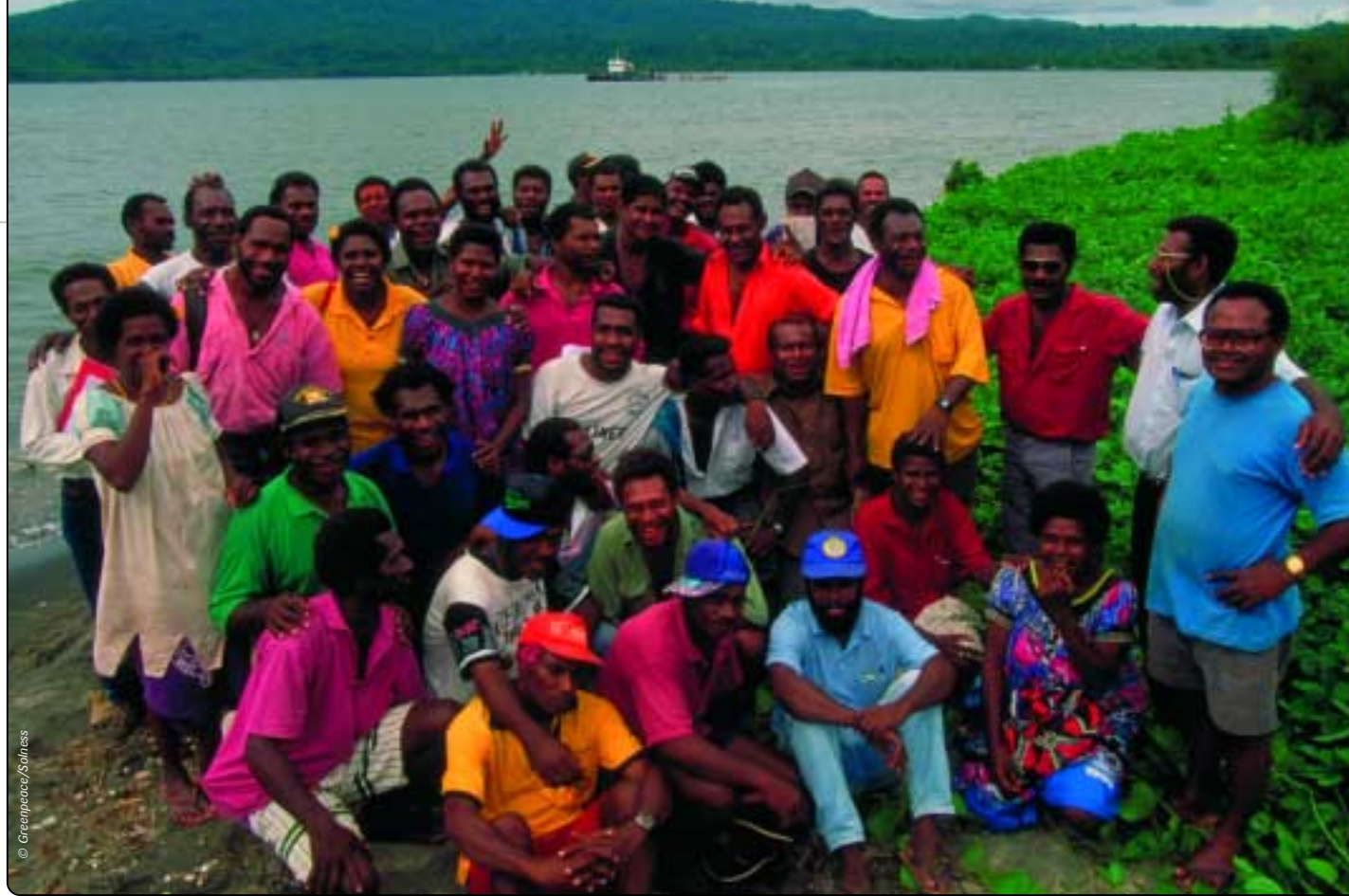
Papua New Guinean customary landowners get together after a workshop with NGOs to discuss their constitutional rights, responsibilities and 'integral human development'

After seven years of logging, however, there is no functional road. Moreover, the logging looks set not only to continue, but also to expand even deeper into the heart of Papua New Guinea's ancient forests.